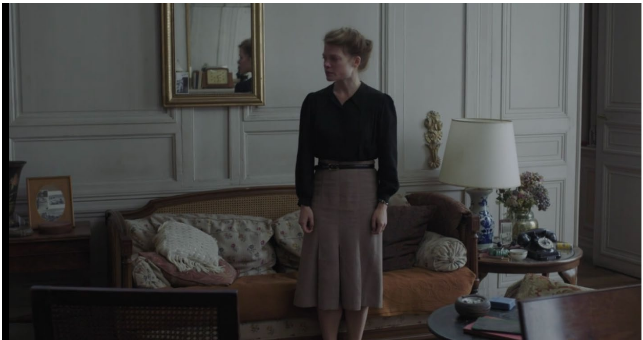
Figure 23. Image: La Douleur : Woman Standing in Front of Couch in a Dreary Room.