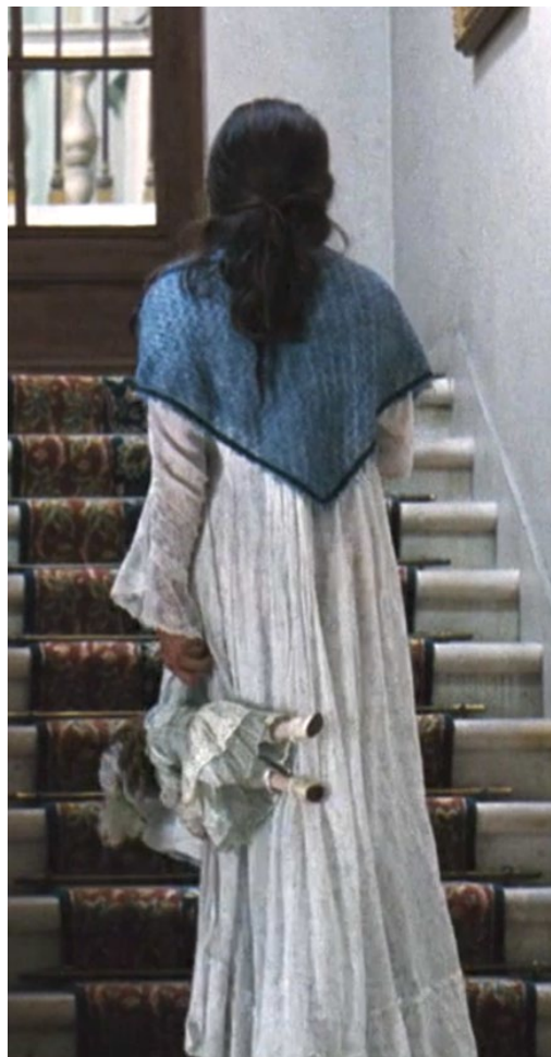
Figure 2. Image: L'Apollonide : Girl in Shawl Ascending Stairs with Doll.