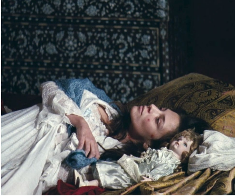
Figure 3. Image: L'Apollonide : Girl in Shawl Resting with Doll. Source: Bonello