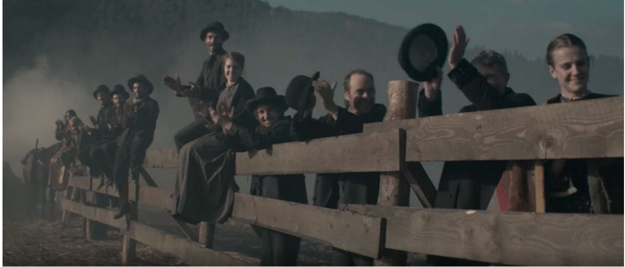
Figure 32. Image: La Danseuse . The ranchers, clad in dusty browns and faded blacks, seem to dissolve into the distant mountains behind, as if the characters were simply extensions of the dirty ground and the dark horizon.