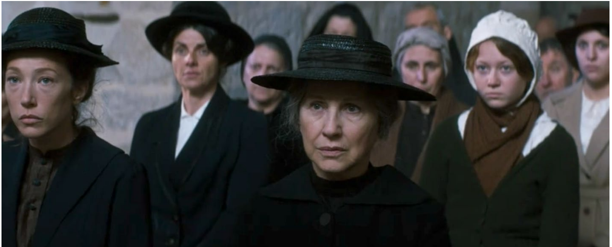
Figure 19. Image: Les Gardiennes : Women in Dark Dress Attending Church.