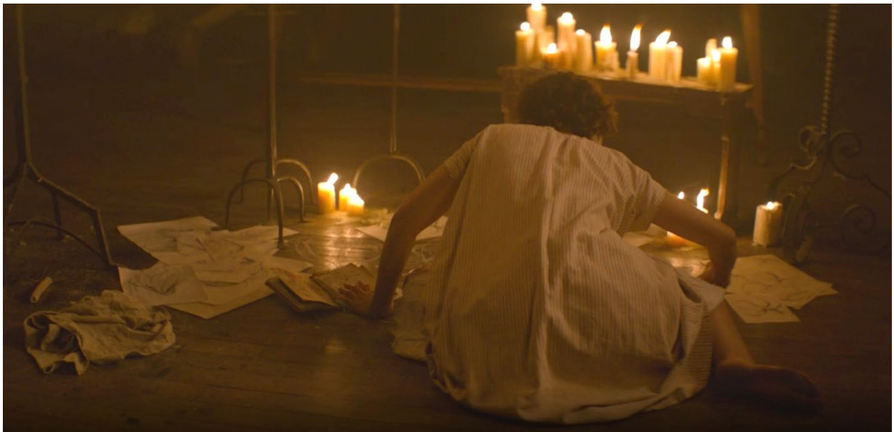
Figure 33. Image: La Danseuse . Fuller merges with her work. The paper thin gown is nestled among the parchment she is using to draw her iconic dance, the candlelight fueling her dreams of dancing in the spotlight.