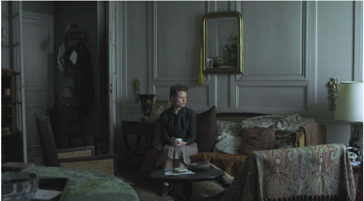
Figure 22. Image: La Douleur : Woman Sitting on Couch in a Dreary Room.