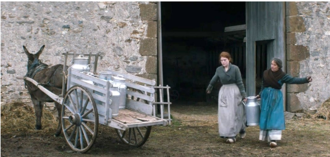
Figure 18. Image: Les Gardiennes : Two Women in Milking Clogs Carrying Stainless Jugs.