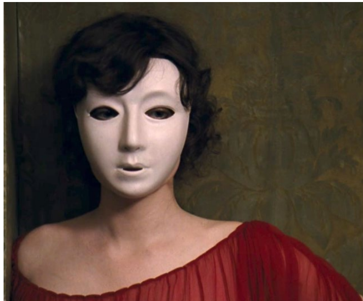
Figure 9. Image: L'Apollonide : Masked Woman in Red #2.