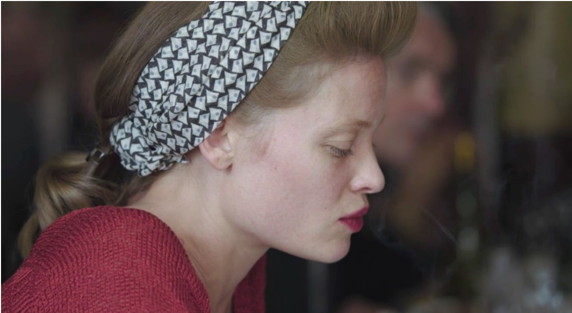
Figure 24. Image: La Douleur : Woman with Headscarf and Red Blouse.