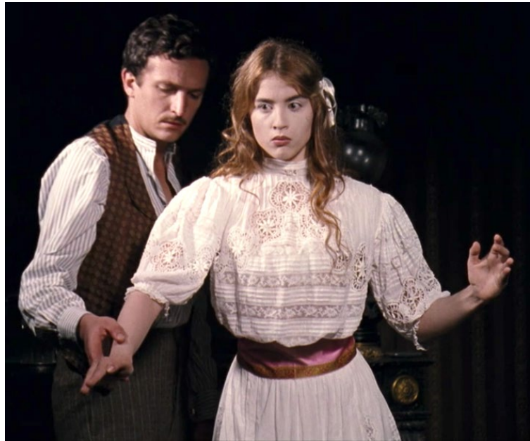
Figure 4. Image: L'Apollonide : Girl as Automaton #1. Source: Bonello