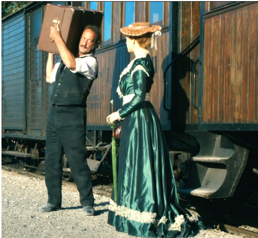
Figure 12. Image: Journal d'une Femme de Chambre : Woman near Train in Shiny Satin.