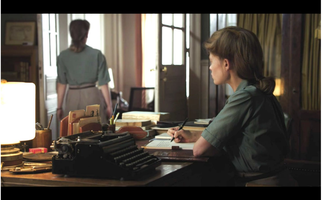
Figure 36. Image: La Douleur .

A hallucination. Duras sees herself pacing about while seated, writing at her desk. The seafoam blue blouses in perfect harmony.