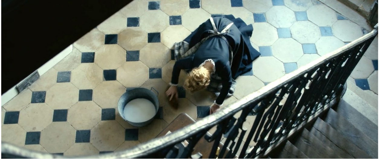
Figure 28. Image: Journal d'une Femme de Chambre : Célestine scrubs the floor. Her black and white uniform perfectly matched to the checkered floor.