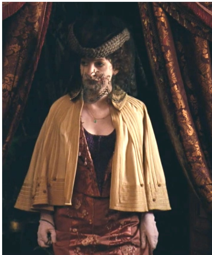
Figure 29. Image: L'Apollonide . Madeleine's dress is cut from the same cloth as the silk draperies.