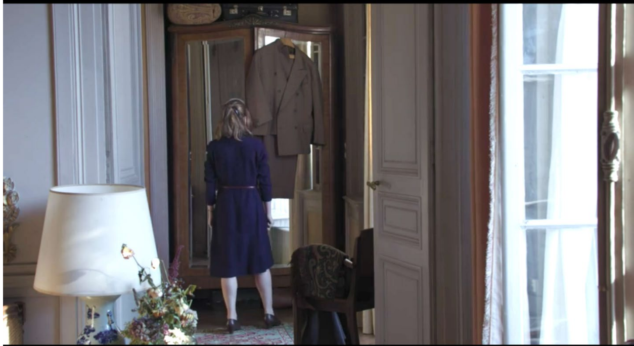
Figure 27. Image: La Douleur : Woman in Navy staring at Hanging Suit.