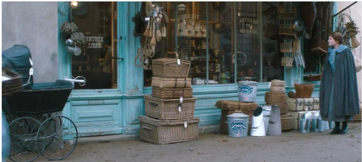
Figure 39. Image: Les Gardiennes .

A unique turquoise shade connects a mother to her son who is leaving for war. Source: Beauvois