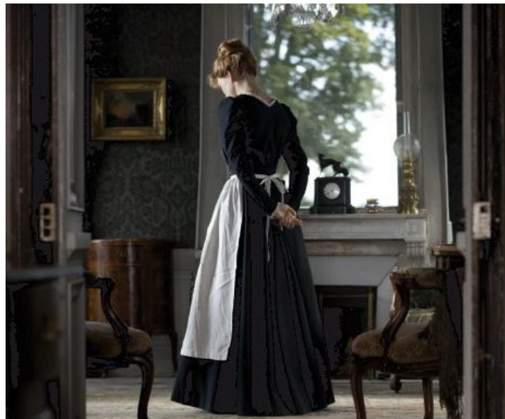
Figure 11. Image: Journal d'une Femme de Chambre : Chambermaid with Hands Interlaced.