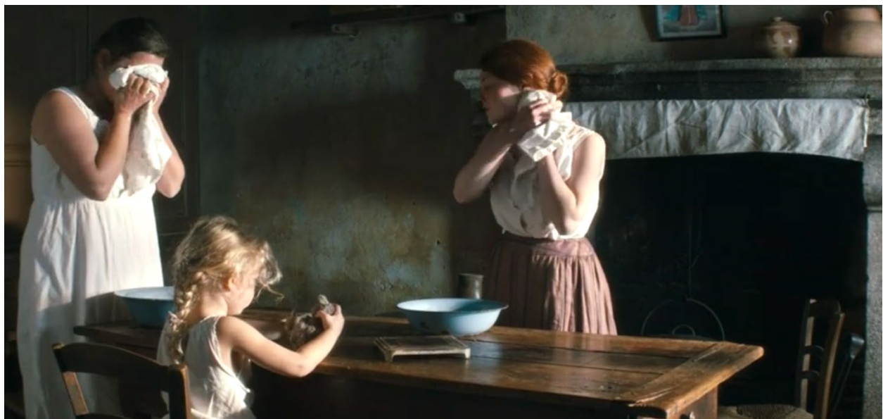
Figure 21. Image: Les Gardiennes : Coming of Age Cleansing Ritual.