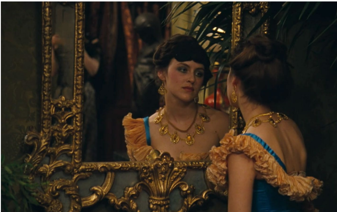
Figure 31. Image: L'Apollonide . The frill of the dress' neckline and the shape of the character's jewelry echo exactly the baroque decoration of the mirror.