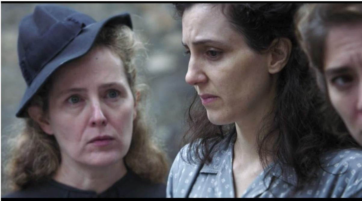
Figure 37. Image: La Douleur .

A hallucination. Duras sees herself pacing about while seated, writing at her desk. The seafoam blue blouses in perfect harmony.