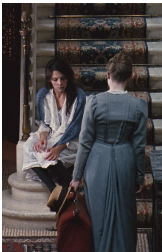
Figure 41. Image: L'Apollonide . A sapphire shawl comforts a dying call girl while the newest addition to the brothel is healthy and safe in powder blue.