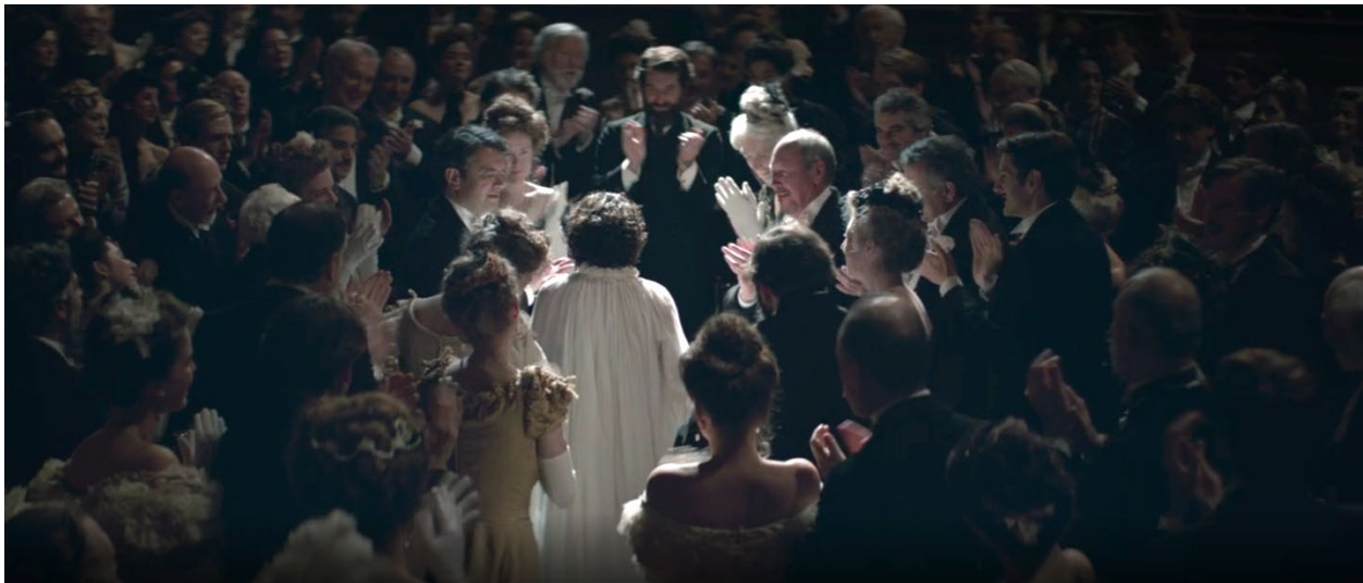
Figure 16. Image: La Danseuse : Woman in Dancing Gown at Center of Applauding Crowd.