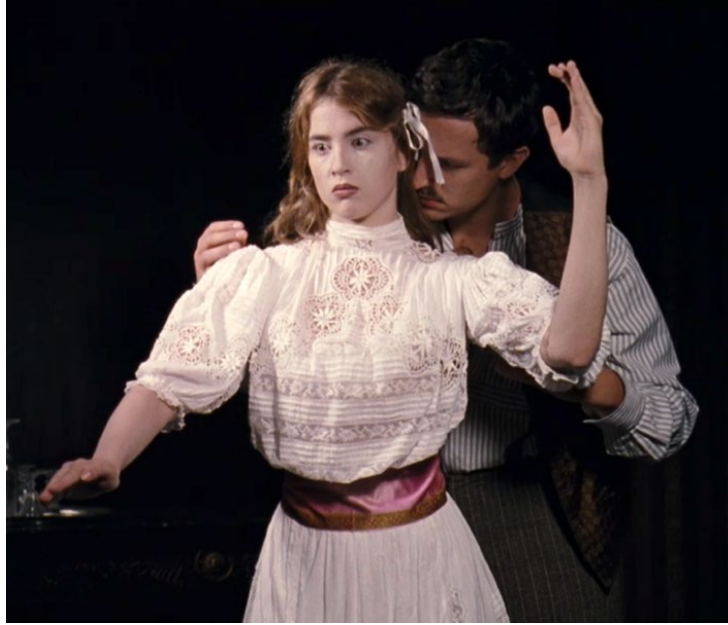
Figure 5. Image: L'Apollonide : Girl as Automaton #2.