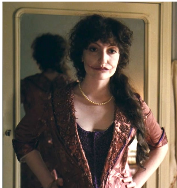
Figure 6. Image: L'Apollonide : Woman with Facial Scars in Brocade Jacket.