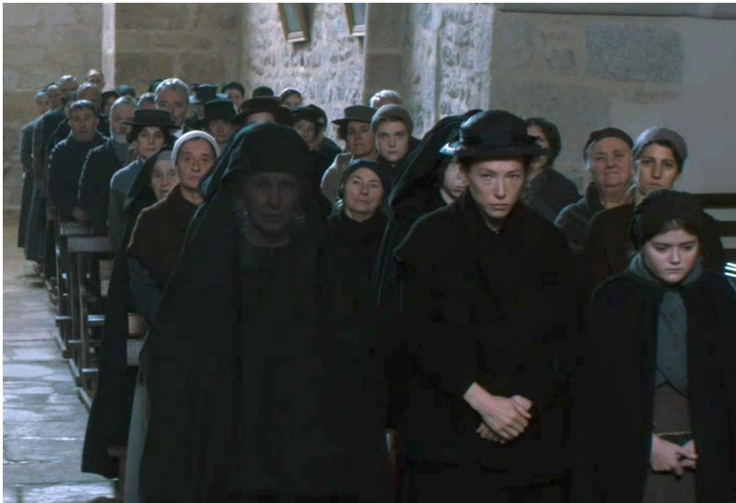
Figure 20. Image: Les Gardiennes : Congregation in Mourning Dress.