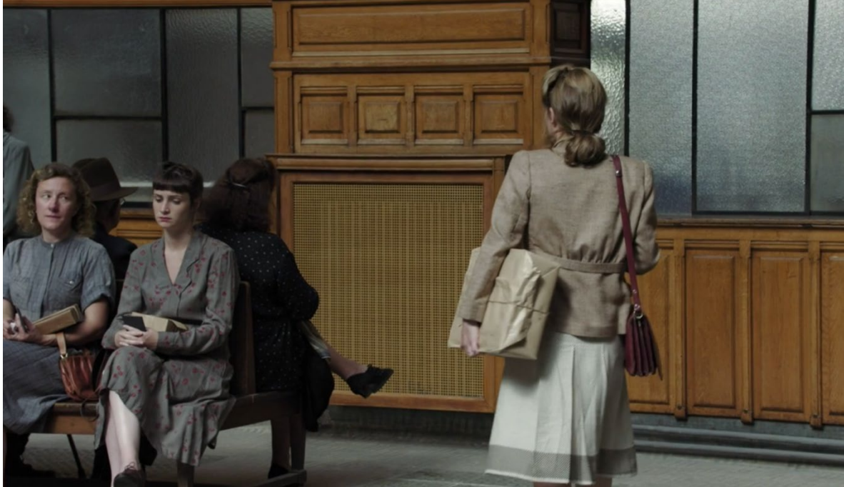
Figure 34. Image: La Douleur . A brown paper package, attached to a brown skirt suit, in a room with a brown floor and brown paneling, among ladies dressed in browns.