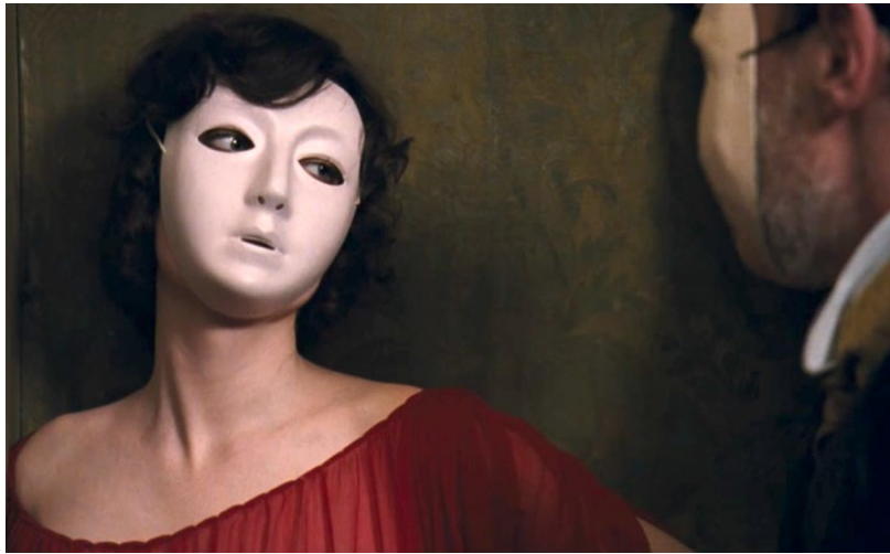
Figure 8. Image: L'Apollonide : Masked Woman in Red #1.