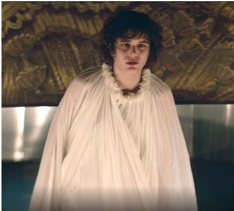
Figure 15. Image: La Danseuse : Woman in White, Gauze, Pleated Gown.