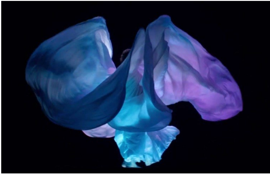
Figure 14. Image: La Danseuse : Dancing Woman Illuminated in Blues and Violets.