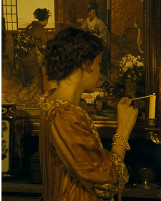
Figure 30. Image: L'Apollonide . The prostitute and the woman in the painting behind her match in color, dress, hair style, and task.