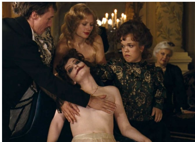
Figure 7. Image: L'Apollonide : Woman with Facial Scars in Nude as Spectacle.