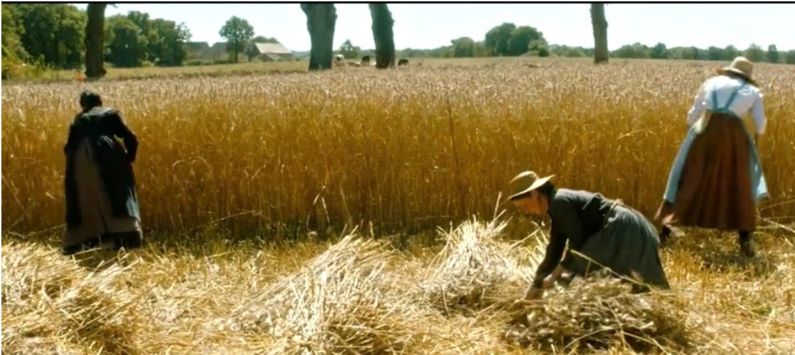
Figure 17. Image: Les Gardiennes : Three Women in Field Dress Harvesting Wheat.