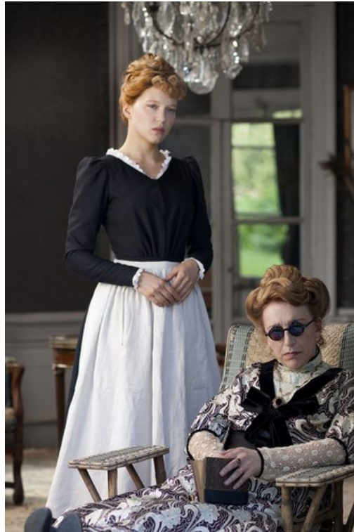
Figure 10. Image: Journal d'une Femme de Chambre : Chambermaid with her Master.