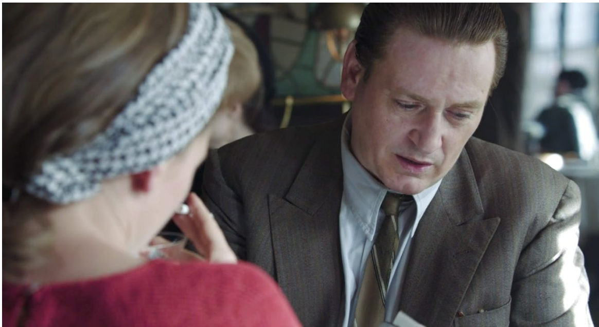
Figure 25. Image: La Douleur : Man in Brown Suit and Slicked Hair.