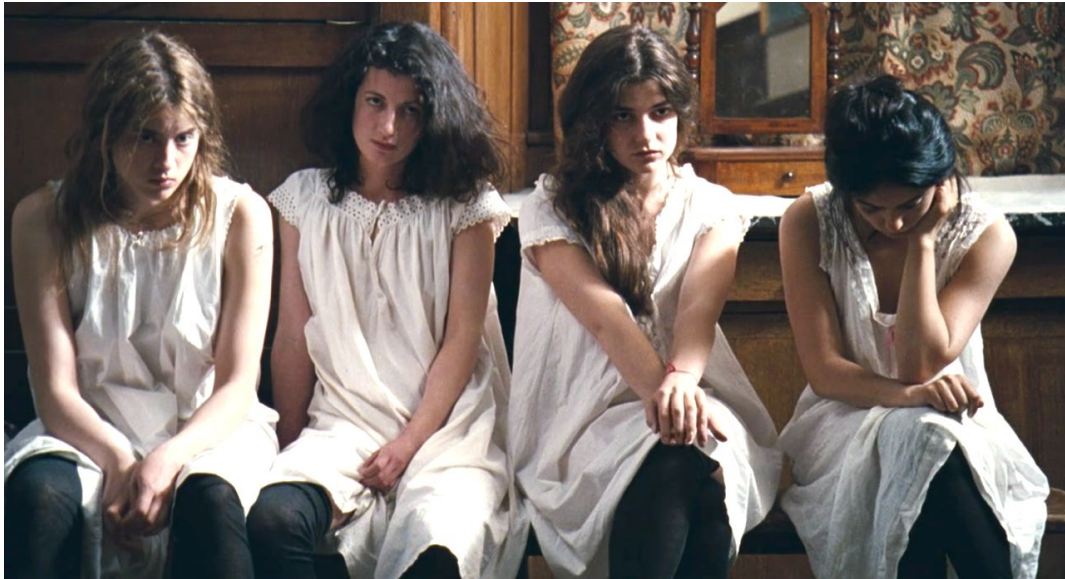
Figure 1. Image: L'Apollonide : Four Girls Seated in White Nightgowns.