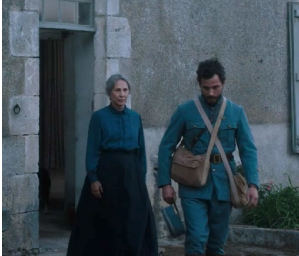
Figure 38. Image: Les Gardiennes .

A unique turquoise shade connects a mother to her son who is leaving for war.