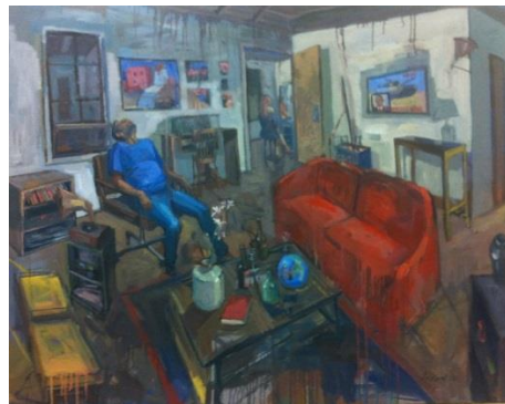
Figure 11: AKM Jaded Rashel, Two Different Worlds , 2013

Over the last year my work has changed expressively from monotonous narrative function to a greater interest in formal investigations. In earlier paintings such as Two Different Worlds (Figure 11) where interior space seems arbitrary and color application looks very loose. The sultry figures are seated on the chairs, but not yet exactly participating in the entire environment of the painting. I have regenerated the same topic in the painting An Unfolding Story I (Figure 12). In this painting I created a theatrical stage to make my narratives clearer and stronger than before. I also worked with more emphatic color to correct the muddiness that was a problem in my earlier paintings.