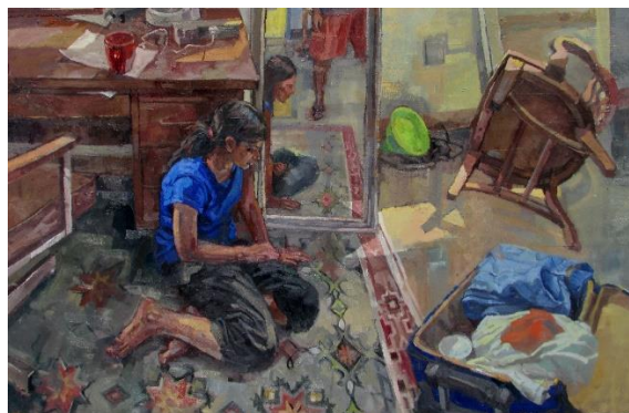
Figure 12: AKM Jaded Rashel, An Unfolding story I , 2013