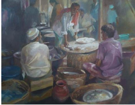
Figure 3: A K M Javed Rashel, Local Market I , 2006