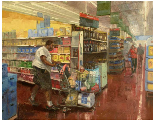
Figure 4: A K M Javed Rashel, Supermarket I , 2013