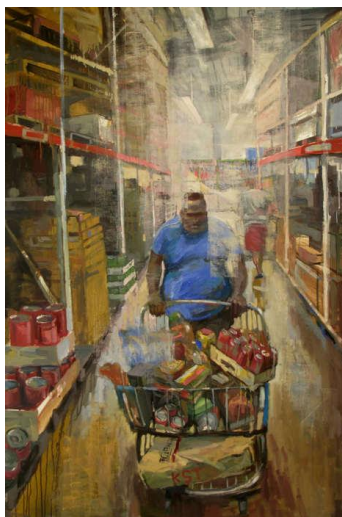
Figure 5: A K M Javed Rashel, Supermarket II , 2013