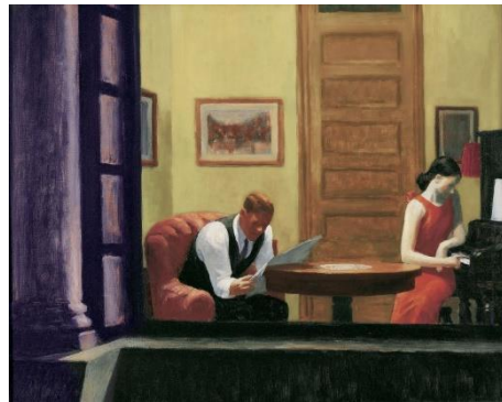
Figure 7: Edward Hopper, Room in New York , 1932

Early influences such as Edward Hopper, George Bellows, Euan Uglow are significant formally and conceptually. Hopper's psychological paintings inspired me to render my relationship paintings in the interior space (Figure 7). In addition, I juxtaposed figures and still life objects to convey an uncanny situation on the surface to help create a quiet atmosphere in my paintings (Figure 8). For various reasons sexual discrimination take place in my paintings. Perhaps it is my root where women are still treated as prisoners.