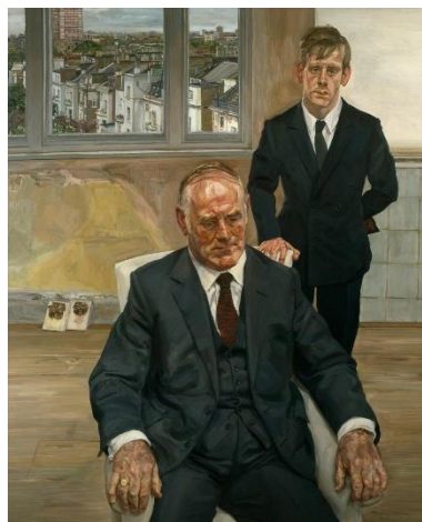
Figure 10: Lucian Freud, Two Irishmen in W11 , 1984-5