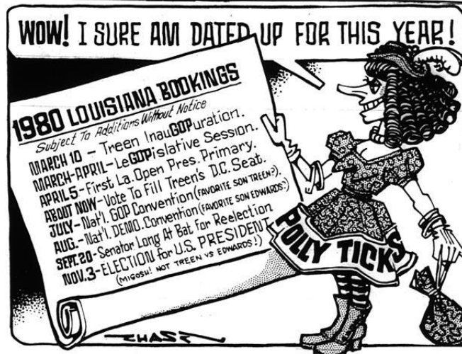
Figure 4: From the February 21, 1980 of The Concordia Sentinel , this Cartoon by John Chase illustrates the multitude of political elections Louisiana faced during 1980, supporting the hypothesis that Louisianians were election-weary by the time of the primary.

The low turnout in the Louisiana primary led many pundits to predict a similar response to the general election. With Reagan's extensive campaigning during the general campaign season, however, voters became enticed by the California governor's conservative messages and, therefore, proved these pundits wrong by netting a much higher turnout, even higher than the national average.