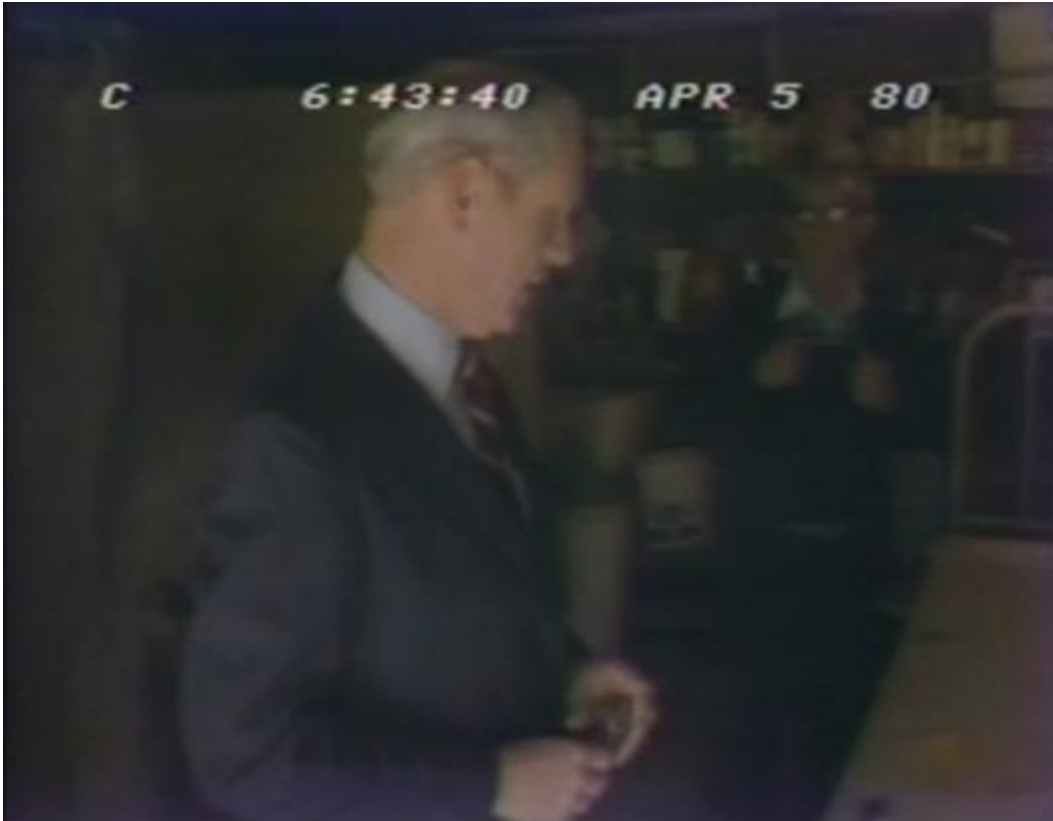
Figure 3: CBS depicted Governor David Treen voting in the garage of a resident, further showing the primitiveness of Louisiana's primary.

Following an interview with State Senator Braden, Engberg explained that the Democratic candidates did not make personal appearances while Republicans came but only briefly. The report included a small quotation from former United Nations Ambassador George Bush when he jabbed at Reagan by saying, "Everyone considers it a Reagan state because he's been here forever and ever and ever and ever and ever, I might add." CBS depicted a Reagan rally minus a sound bite. The report continued by showing several polling places; while one appeared to be in a school gymnasium, the others were in some unsophisticated spots, like garages and dilapidated buildings. Governor Treen was shown casting his vote in someone's