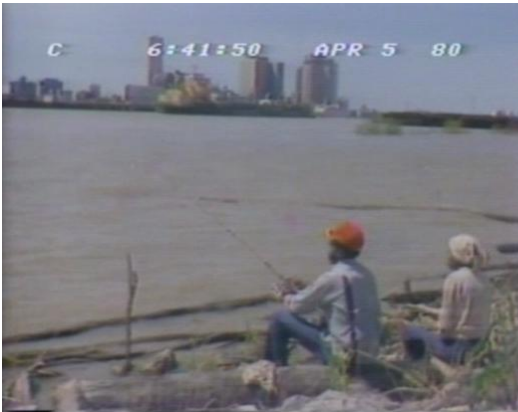
Figure 2: CBS began its primary coverage showing this scene of an African-American couple fishing.

of the primary traded in the stereotypes. Reporter Eric Engberg's coverage begins by depicting an African-American couple fishing on the Mississippi River across from New Orleans (see Figure 2), while he explains that politicians are calling it the "ho-hum primary, as candidates joined with voters in resisting the effort to make Louisiana a major battleground state."