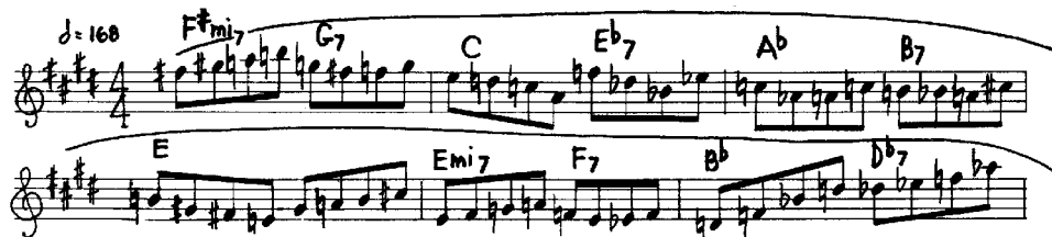
Example 3.3: John Coltrane, Countdown , mm. 1–6 (Saxophone Solo Only)

As in Coltrane's Countdown , the chromatic notes in Baker's variation can be explained as a mixture of passing tones (the g-sharp' in m. 9 of example 3.2), auxiliary tones (the b-natural in m. 9), and extensions of a tertian chord (the a-flat' in m. 10).