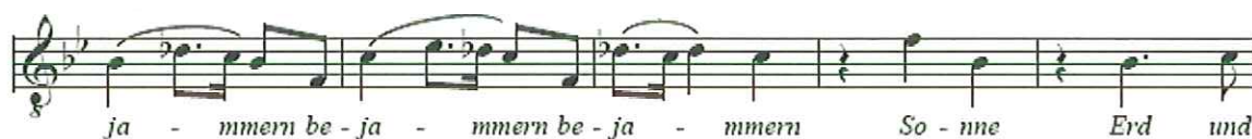
Figure 13. Measure 46-50 in the tenor solo of mvmt. III.

Another pictorial device used by Graupner in this movement is the setting of the German word bejammern or ‘lament’ on a melisma of intervals containing augmented seconds and jumps of minor sixths connected through a descending minor third interval (Figure 13). The pain-charged interval of an augmented second, combined with the descending minor third, reflects this anguish.