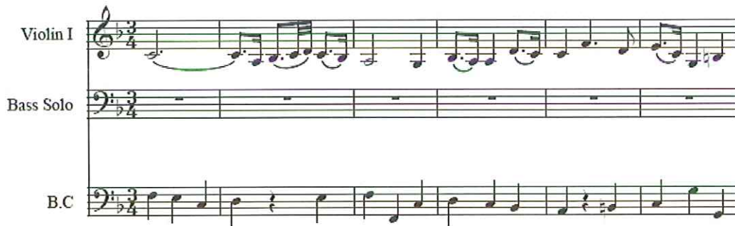
Figure 19. Measures 1-6 of mvmt. VII.

the once fallen creation is a powerful Lutheran idea used repeatedly during the Good Friday service. 61