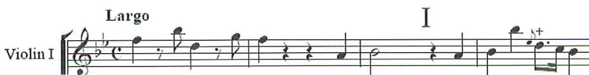
Figure 23. Measures 1-4 of mvmt. I, first violin part.

Quantz summarized the appoggiaturas in this composition when he wrote: “they [appoggiaturas] receive their value from the notes before which they stand.” 67 In this case, measure four of the first violin contains (Figure 23) an appoggiatura note in front of a dotted eighth-note.