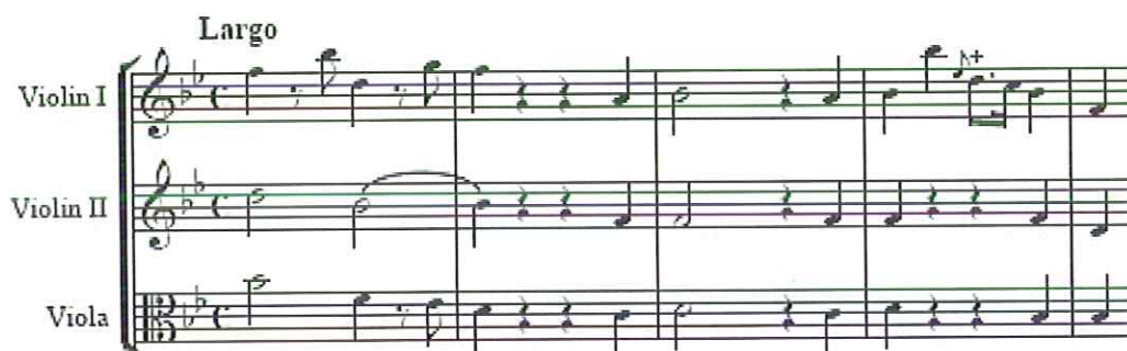
Figure 8. The first four measures of Graupner's GWV 1127/19.

Figure 7 represents the move from I in B b , to V/vi – V- I with the G minor never sounded, but implied. The F# in the alto part of measure 2 provides the momentary transition to the G minor tonality, quickly evading it by the end of the same measure. The tempo marking of this movement is Largo , and there is no elaborate instrumental introduction. This indicated tempo marking might be misleading however, because the rhythmic content of the introductory instrumental parts point toward a French overture-like pacing. The dotted quarter note (the dot is treated as a rest here) followed by the eighth-note motif in the first violins, is very much in the style of the French overture (Figure 8.)