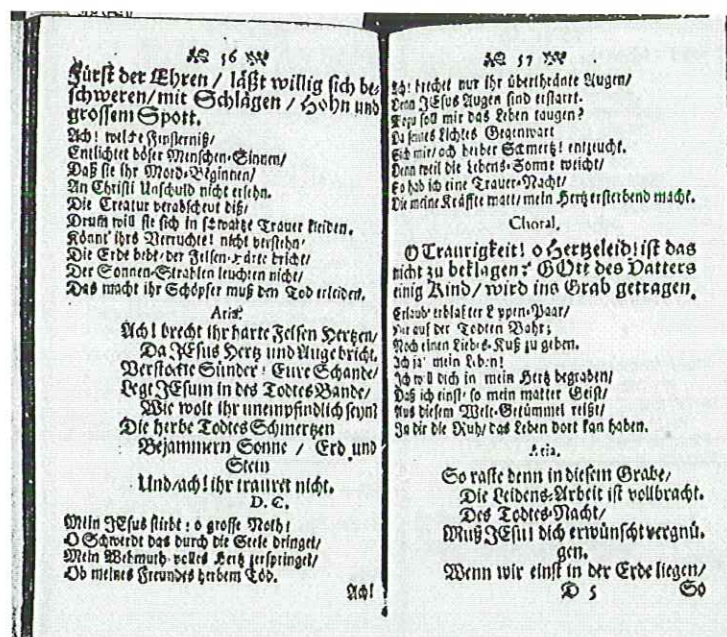
Figure 28. Pages 56-57 of Lichtenber's published text of the GWV 1127/19 Cantata