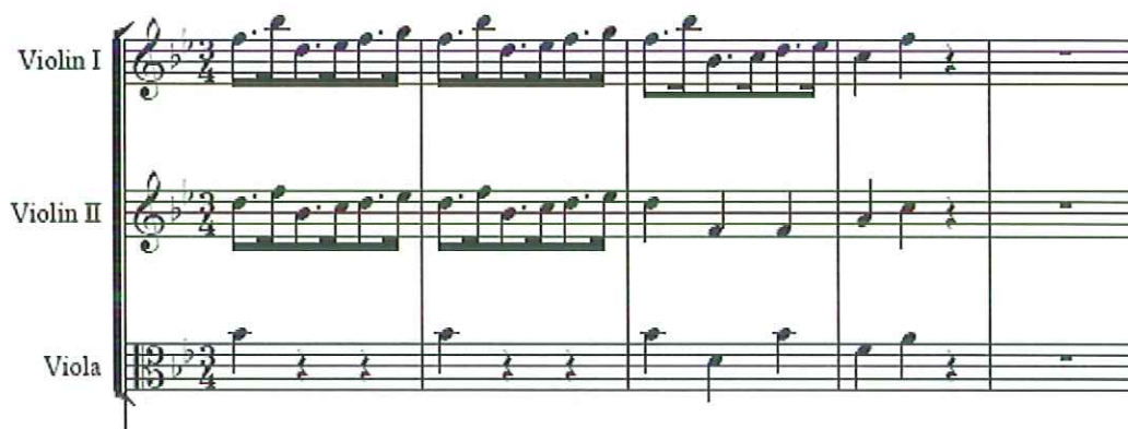
Figure 22. Measures 1-5 of mvmt. IX.

Graupner made use of a four-measure long ritornello in the first and second violin parts containing a dotted eighth – sixteenth note motive. This device helps the chorale melody move forward (Figure 22). The four-measure dotted rhythmic refrain of the violins (Figure 22) against the more static chorale melody creates the needed motion. The movement ends with an instrumental extension of eight measures. Comprising the same dotted-rhythm ostinato present throughout the movement, its harmonic progression of I – ii – V 7 – I indicates a coda.