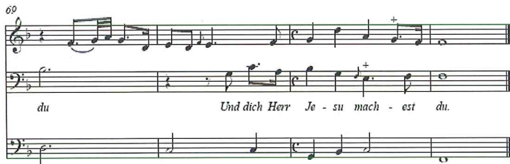
Figure 20. Mm 69-72 of mvmt. VII.

The violin obligato part, showed in the figure above, appears in the low register of the instrument presented in counterpoint with the soloist's melody. The introduction of extensive counterpoint this late in the work stands in observing Lichtenberg's text-setting theology of acceptance of the final sacrifice. 62 The soloist sings the gracious minuet melody anticipating the 'susser Ruhe' ('the sweet rest'). This acceptance occurs only in the final two measures of the arioso when both the violin part and the bass solo appear note-against note (Figure 20).