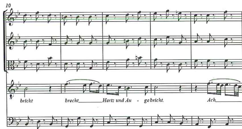
Figure 12. Measures 10-14 of mvmt. III.

The ‘sinner-saint’ dualism may be interpreted musically as well. The instrumental accompaniment, set in a \frac{3}{4} time signature, plays three short eighth-notes per measure throughout the entire movement. The broken arpeggiation of the string section against the smooth, legato line of the soloist might be an indication of Graupner’s awareness of the Lutheran concept of two different ideals within one entity (Figure 12.). This is the only time Graupner makes use of the short, broken arpeggiato figure which better sustains the idea of dualism through music. The eighth - note motive, illustrated in Figure 12, and present in the string section, is placed against the repetition of the word “break” in the tenor solo, creating a sense of different worlds.