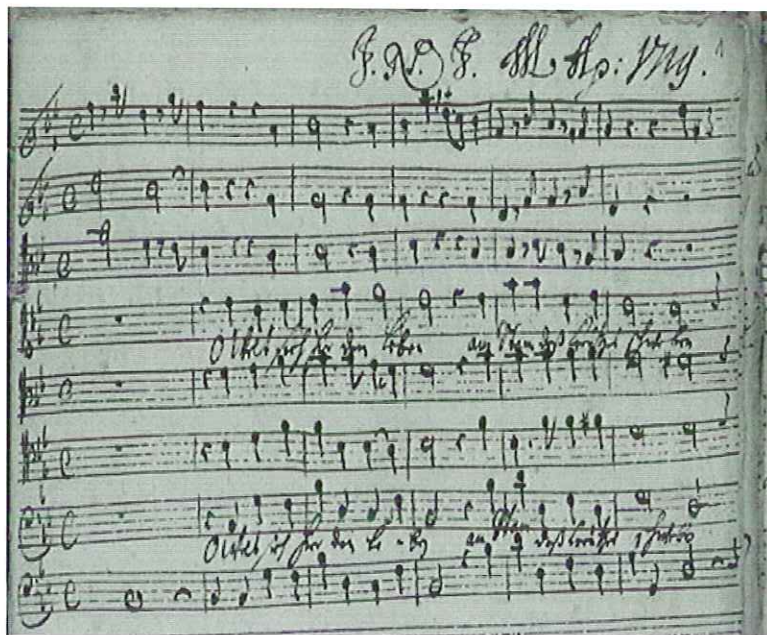
Figure 27. The first page of Graupner's GWV 1127/19.

scores, I decided on the most appropriate text underlay. The syllables were carefully aligned against the stressed-unstressed parts of the music measures such that an aurally correct presentation of the text is preserved. This detailed work was applied throughout the entire manuscript, with the end result being the modern edition presented in this paper.