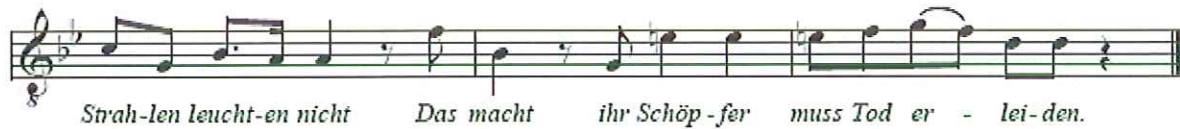
Figure 11. Measures 13-15 in mvmt. II

Baroque composers used this common approach to depict the fallen and holy worlds with minor and major intervals and sonorities.