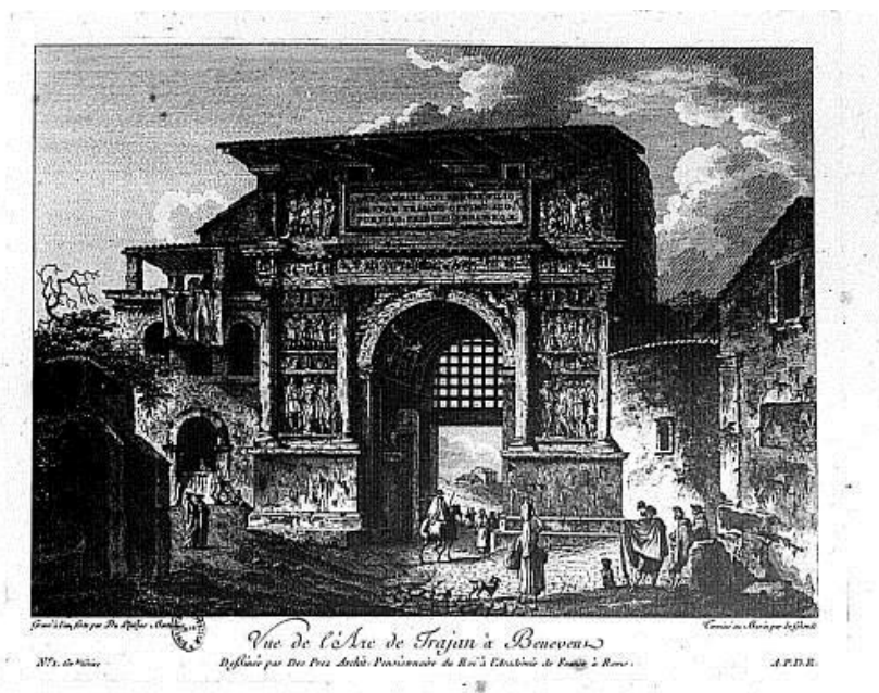
Figure 4, De Ghendt, Vue de l'arc de Trajan à Benevent , c. 1800. Engraving. Bibliothèque nationale de France.

Sarazin de Belmont's The Roman Theater at Taormina ( Vue du Roman Theater à Taormina ), seems to replicate directly the view of the theater as seen in Saint Non's text (Figures 5 and 6). Not only is the subject captured from the exact view point in both works, but even the figures are placed in the same position in the picture plane. Sarazin de Belmont painted this view early in her career, c. 1828. It can be assumed that this work, presented at the Salon of 1833, is a reinterpretation of the exact scene presented in Saint Non's book c. 1780. This replication is not a mere coincidence, but a deliberate reworking of the engraving completed by the artists accompanying Saint Non forty years previously. 16 In the catalogue for her 1859 Auction, Sarazin de Belmont included another work featuring this subject for sale. The difference between this work, Vue de teéâtre de Taormina en Sicile , and The Roman Theater at Taormina is the time of day each