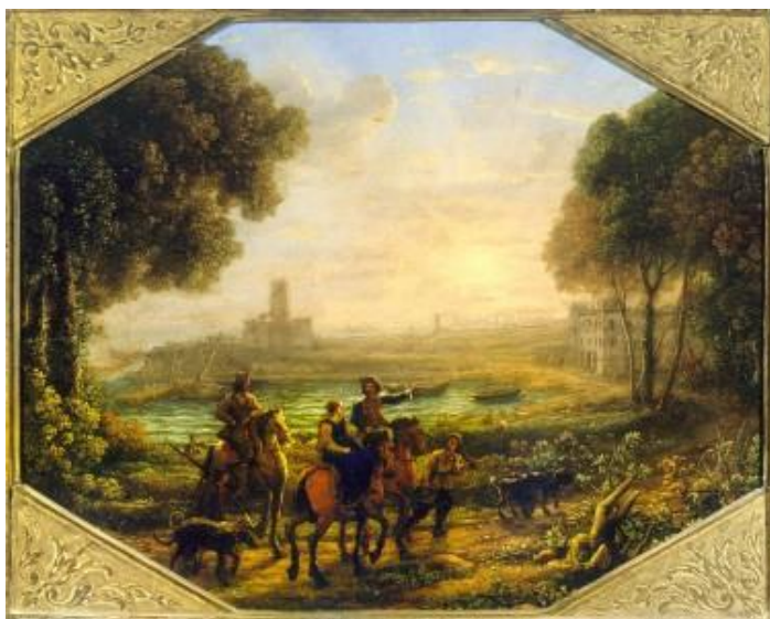
Figure 15 Claude Lorrain, The Port of Santa Marinella , c. 1640. Oil on copper, 28 x 35.5 cm. Musée du Petit Palais, Collection Dutuit, Paris.

Claude moved to Via Paolina in 1650 and thereafter rarely left the immediate neighborhood. 38 Occasional trips to make nature studies were the only occurrences that would take Lorrain away from the city. Accounts of Claude's early career and extensive studies come from fellow painter and friend Joachim von Sandrart. His biography of Claude is filled with personal accounts, though his dates are less exact than Claude's second biographer, Filippo Baldinucci (1624-1697). During these excursions into nature Claude assembled a book of drawings and sketches that numbered 195 by the end of his life. Begun in the 1630's, Claude's Liber Veritatis recorded the dates of each sketch and the names of patrons attached to the preliminary chalk and pen drawings. 39