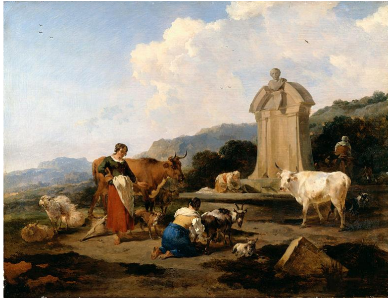
Figure 12 Nicolaes Berchem, Italianate landscape with fountain and shepherds , c. 1645. Oil on canvas, 36.8 x 48.4cm. Dulwich Picture Gallery, London.

popularity of the southern Italian landscape rose with the works of Dutch landscape artists working in Italy and would remain high through the next two centuries. 31