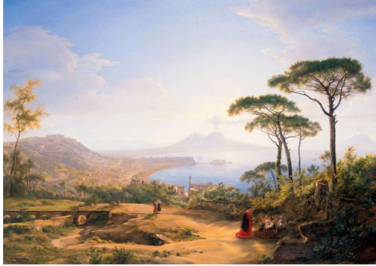
Figure 34 Sarazin de Belmont, Vue de Naples , c. 1842. Oil on canvas, 140 x 198 cm. Musée des Augustins de Toulouse.

The final work in this series is View of Paris ( Vue du Paris ) (Figure 35). This painting is not an allegorical subject. Rather, it serves as a painted tribute to the Gros family, with, in the center, their mausoleum, the resting place of the late painter. The tomb of David is set behind Gros' mausoleum, both protected by the shade of a large tree. From the vantage of the cemetery of Père-Lachaise, where the tombs reside, the city of Paris emerges from the horizon. 112 Père-Lachaise was first opened in 1804, and served as the first garden cemetery in Paris. 113 This idealized location is befitting of a composition of Sarazin de Belmont, however, Gros is not recorded to have been buried in this cemetery, making this composition fictional. 114