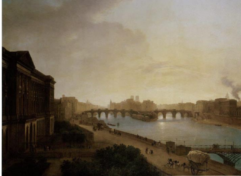
Figure 8 Louise Josephine Sarazin de Belmont, Vue de Paris prise de la galerie d'Apollon , 1835. Oil on canvas. 124 ½ x 160 cm. Museum of Art, Rhode Island School of Design, Rhode Island. 24