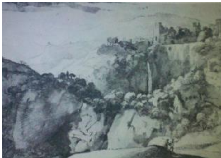
Figure 16 Claude Lorrain, View of Tivoli , c. 1640. Pen, brown and red wash, 21.5 x 31.75 cm. British Museum, London.

Claude's favorite location to study from nature was Tivoli, Italy. 40 Sandrart recorded in Claude's biography at least one occasion where Nicolas Poussin traveled with Claude and himself, to paint and draw from nature. View of Tivoli , dating near 1640 (Figure 16), is one of the many scenes Claude captured during his studied. The scene is represented again in Sarazin de Belmont's 1826 painting, The Falls at Tivoli (La Cascade de Tivoli) (Figure 17). Though the two compositions are not directly related it is endearing to see two such dedicated landscapists working from the same subject nearly ninety years apart. Lorrain's influence on the art of Sarazin de Belmont can be seen in her meticulous attention to the details of nature. The two artists immersed themselves in their surroundings during study trips; neither would leave their post until they had captured on paper the vista before them. Such dedication is what set the artists apart from their respective contemporaries. 41