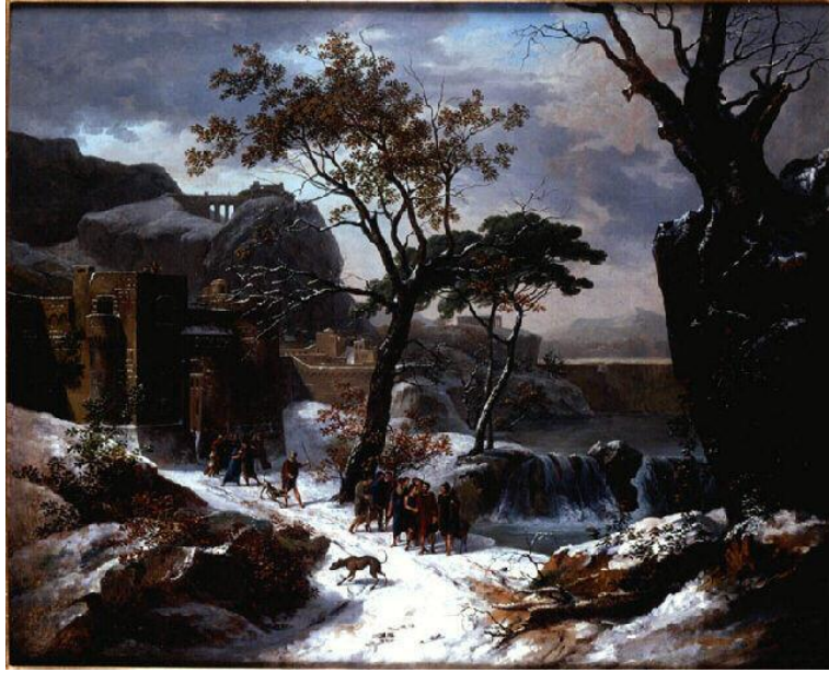
Figure 28 Louise Josephine Sarazin de Belmont, Paysage italien , c. 1821. Oil on canvas, 81 x 100 cm. Musée Lambinet, Versailles.