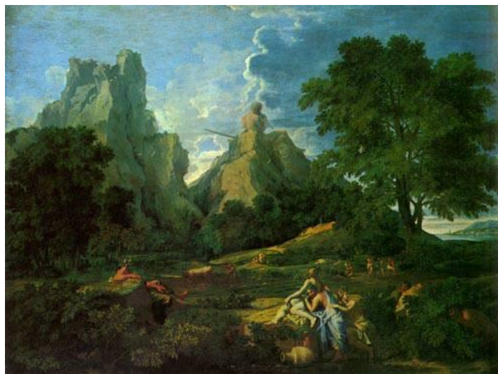
Figure 21 Nicolas Poussin, Landscape with Polyphemus , 1649. Oil on canvas, 147.3 x 195.5 cm. The Hermitage, Leningrad.

studies en plein air . However, he did set himself apart in his renderings of nature. Unlike Lorrain, Poussin's landscapes do not change from one canvas to another. He did not wish to capture the ever changing currents of the natural elements, but strove to create an archetype of nature that could host the intellectual messages he wished to convey through his paintings. In comparison with Lorrain, and subsequently Sarazin de Belmont, Poussin's use of light effects should be briefly discussed. Landscape with Polyphemus , dating to 1649, can be used as an example to illustrate Poussin's softened light (Figure 21). In his landscapes light does not drench the canvas as it does in Lorrain's scenes; rather it is used to highlight the pictorial elements on the canvas while still leaving these elements distinct from the atmosphere that surrounds them. This style of lighting was used by Sarazin de Belmont in Le Cascade du Tivoli ( The Falls at Tivoli ), c. 1826, and many of her other paintings (Figure 22). The scene she had depicted is brightly lit with sunlight but the air remains crisp and clear to better show the cascade which is central in the scene. 62