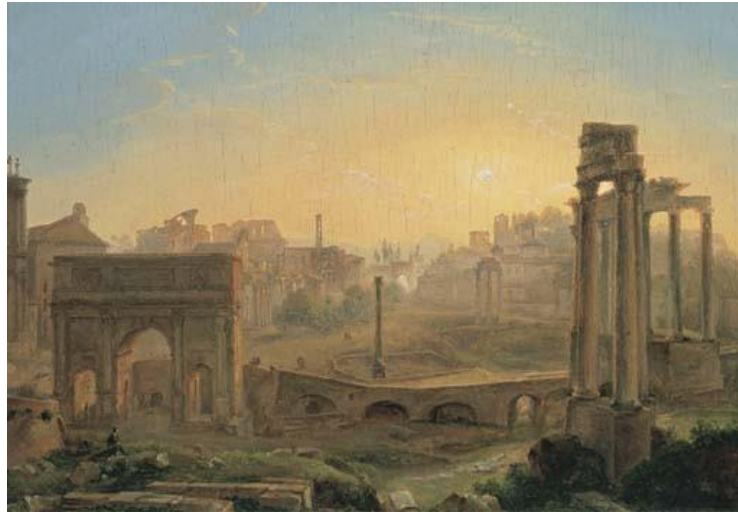
Figure 2 Louise Josephine Sarazin de Belmont, Vue du Forum romain, avec l'arc de Septime Sévère , 1865. Oil on wood. 15 x 24 cm. Lempertz auction house. 15

location in Rome indicates retention of his work, years after her education was complete. 14