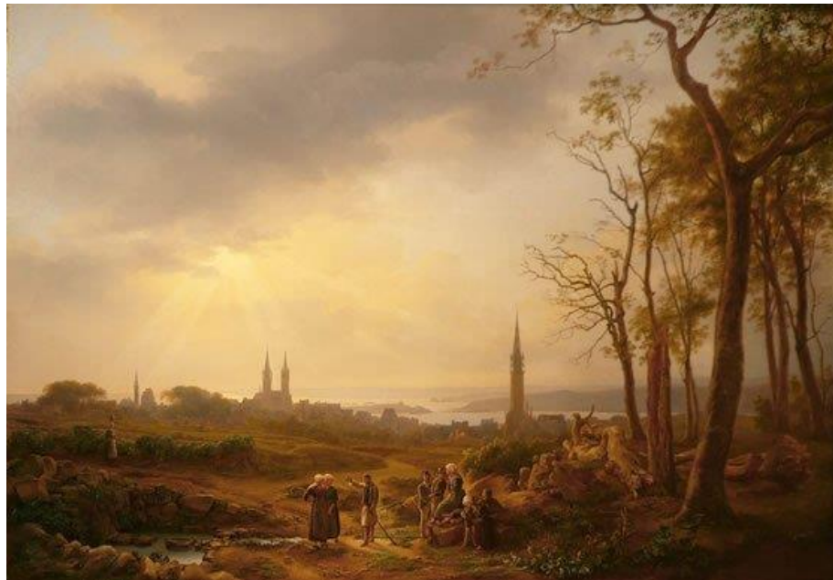
Figure 19 Louise Josephine Sarazin de Belmont, View of Saint-Pol-De-Léon , c. 1830. Oil on canvas, 62.2 x 88.9 cm. Sold by the Stair Sainty Gallery, London.