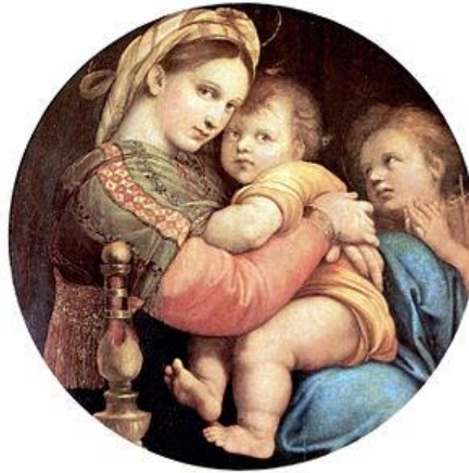
Figure 36, Raphael, Madonna of the Chair , c. 1615. Oil on panel, 71.1 x71.1 cm. Palazzo Pitti, Florence.

in auction catalogues and museum publications. By comparing these archival materials with her surviving works a lexicon is created and an artist that was once forgotten can be revived.