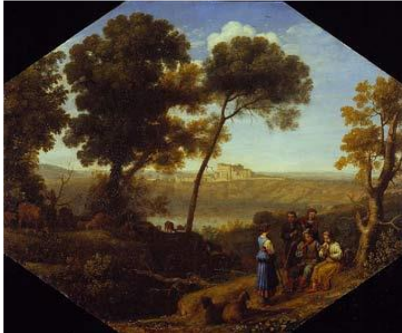
Figure 14 Claude Lorrain, Pastoral Landscape with Lake Albano and Castel Gandolfo , c. 1640. Oil on copper, 30.5 x 35.5 cm. The Sydnics of the Fitzwilliam Museum, Cambridge.