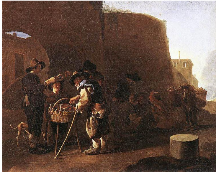
Figure 11 Pieter van Laer, The Cake Vendor , c. 1630. Oil on Canvas. Galleria Nazionale, Rome.

excursion that van Laer took with Claude and Poussin to Tivoli, where the three painters studied the views of the city. 30