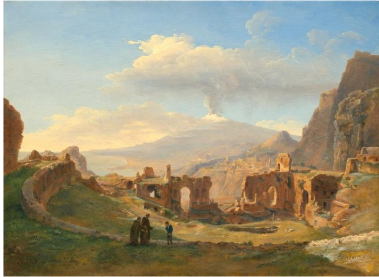
Figure 5 Louise Josephine Sarazin de Belmont. The Roman Theater at Taormina , 1828. Oil on paper mounted on canvas. 41.6 x 57.5 cm. National Gallery of Art, Washington D.C.

captures. While The Roman Theater at Taormina is taken during the day, the second study is described as “Clair de lune,” showing that Sarazin de Belmont explored this subject at least twice, maybe more. 17