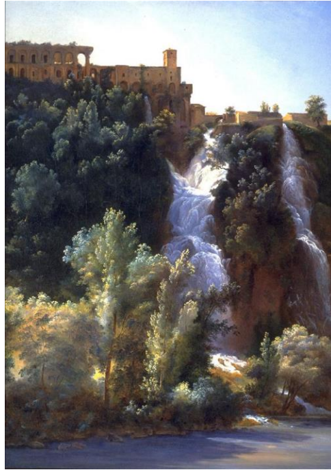
Figure 22 Louise Josephine Sarazin de Belmont, The Falls at Tivoli , c. 1826. Oil on paper laid on canvas, 57.5 x 41.6 cm. Fine Arts Museums of San Francisco, San Francisco.

As with all of his subject matter, he desired to bring an order to the picture plane, and control was eternally at the forefront of his mind during the creative process. Taken directly from the writings of Ovid, the scene is set in Sicily, Italy. While there is no definitive sign marking the land as belonging to the island, the scene is composed of a generalized terrain, much as one would see in Sicily. 63 In these landscape paintings Poussin uses the earth to show the frailty of man. He achieved this by depicting man's subjective position to the will of nature and his understated presence in her vast expanse. Poussin organized his landscapes so as to allow nature to dominate his figures. 64 It was