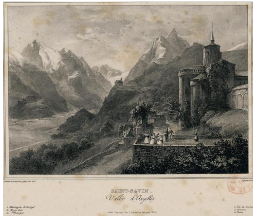
Figure 7 Louise Josephine Sarazin de Belmont, Vue de couvent de Saint-Savin , 1833. Lithographic print. Bibliothèque nationale de France.

couvent de Saint-Savin is only one of the twelve scenes contained in the publication (Figure 7). 20