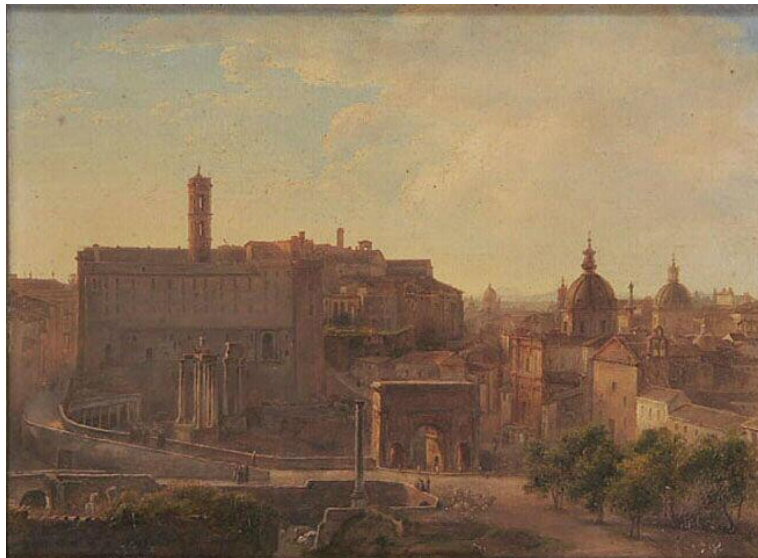
Figure 3 Louise Josephine Sarazin de Belmont, Vue du forum et du capitole à Rome , c. 1867. Oil on wood. 21 x 28 cm. Musée Ingres, Montauban.