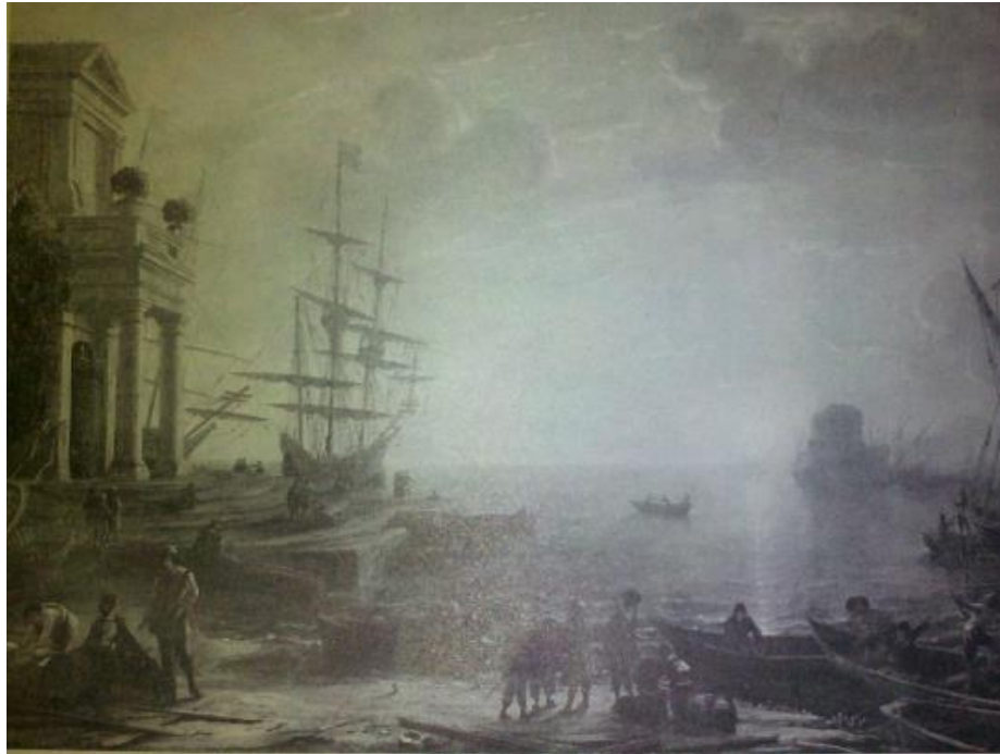
Figure 18 Claude Lorrain, Harbour Scene , c. 1638. Oil on canvas, 96.7 x 53.3 cm. Private Collection, Paris.

and detailed depiction of the trees in this scene distinctly favor Claude's work, although the work overall exposes the advanced age of Sarazin de Belmont in its lack of finishing.