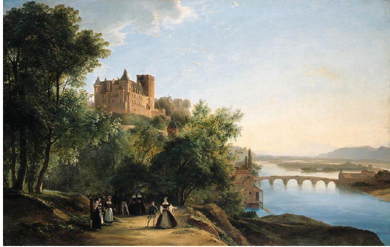
Figure 26 Louise Josephine Sarazin de Belmont, Le Château de Pau vu du parc , c.1835. Oil on canvas, 75 x 100.5 cm. Musée des beaux-arts, Pau.