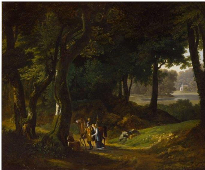
Figure 31 Louise Josephine Sarazin de Belmont, Scenes from the life of Jeanne of Navarre, duchesse de Bretagne (set of two), c. 1830. Oil on canvas, 54 x 64.7 cm Wengraf auction house.