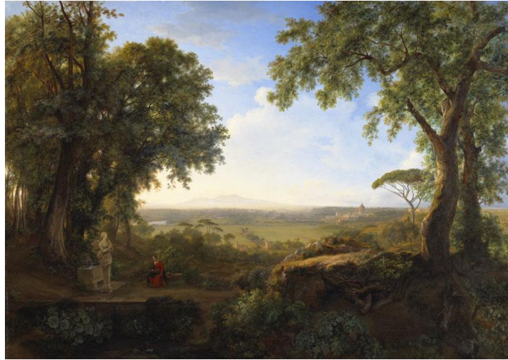
Figure 33 Louise Josephine Sarazin de Belmont, Vue de Rome , c. 1842. Oil on canvas, 140 x 198 cm. Musée des Augustins de Toulouse.

The second painting in the series is View of Rome (Vue de Rome) (Figure 33). This scene was taken from the Villa Millini on the Monte Mario. The Roman countryside sits below the widow Duresne, who is captured in a moment of repose. Though she still resides in the shadows of the wood, Duresne is no longer prostrate with grief. This pose indicates an evolution of her grief and represents the hope renewed after her husband's death.