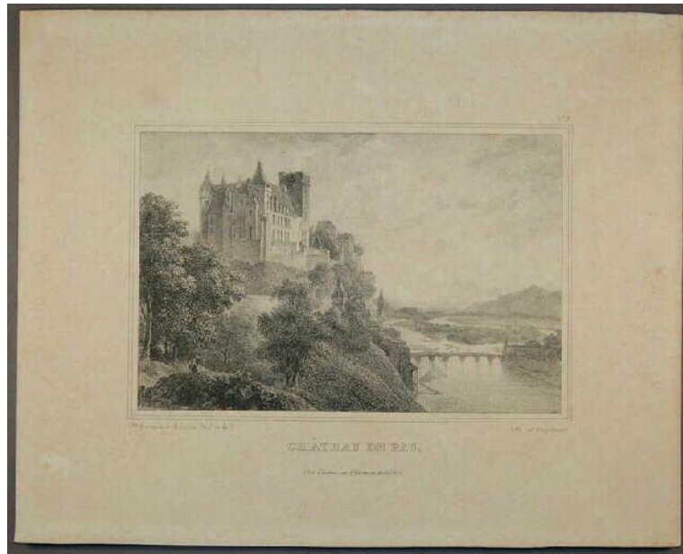
Figure 27 Louise Josephine Sarazin de Belmont, Château de Pau vu depuis l'Est , c. 1835. Lithographic print, 24 x 30 cm. Musée national du château de Pau, Pau.

Her vistas were praised for their perspective in auction catalogues. Lyike Lorrain before her, Sarazin de Belmont was able to convey atmosphere in her picture planes. The strict rules ordained by Valenciennes in Éléments , regarding the study of light, which blended the techniques of the masters Lorrain and Poussin, allowed for the creation of