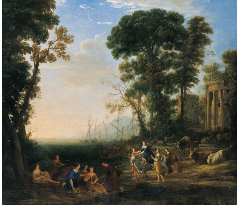
Figure 13 Claude Lorrain, Coast Scene with Europa and the Bull , c.1634. Oil on canvas, 170.2x 198.1 cm. Kimbell Art Museum, Fort Worth.