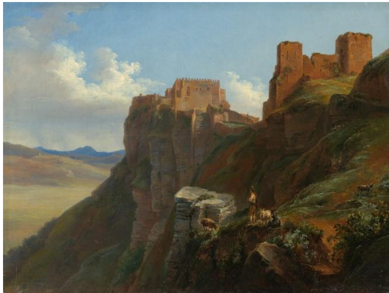
Figure 29 Louise Josephine Sarazin de Belmont, View of the Castello di San Giuliano, near Trapani, Sicily , c. 1824. Oil on canvas, 22.8 x 27.9 cm. National Gallery of Art, Washington D.C.