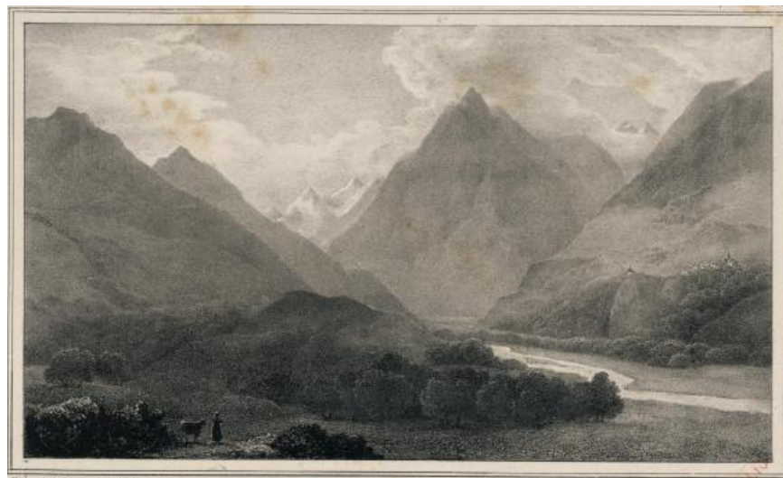
Figure 23 Louise Josephine Sarazin de Belmont, Vue de la Vallée d'Argelles , 1833. Lithograph, 15 in plate. Bibliothèque municipale de Toulouse, Toulouse.

The paysage historique style of Mademoiselle Sarazin de Belmont similarly dwarfs the importance of man in comparison to nature. When examining her works one is likely to find human figures included as picturesque details rather than as feature characters. This is particularly obvious in her studies of the Valley of Argelles from the early 1830's, where the small figures situated amongst the mountains and hills have the potential to be missed completely, given their miniscule size (Figure 23).