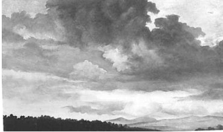
Figure 25 Pierre Henri Valenciennes, In Rome: Study of a Cloudy Sky , c. 1782. Oil on paper mounted on cardboard. Musée de Louvre, Paris.

It was Valenciennes' goal to educate his readers and students in such a way as to elevate landscape painting as a whole in the academic hierarchy. Of his own publication he wrote "We have fulfilled our goal and we will estimate ourselves happy if this feeble essay on the art that is our delight can be useful to a single pupil, and help to form an artist in the genre of landscape." 96