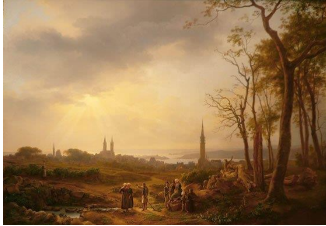
Figure 10 Louise Josephine Sarazin de Belmont, View of Saint-Pol-De-Léon , c. 1837. Oil on Canvas. 62 x 91 cm. Stair Sainty Gallery (Sold).