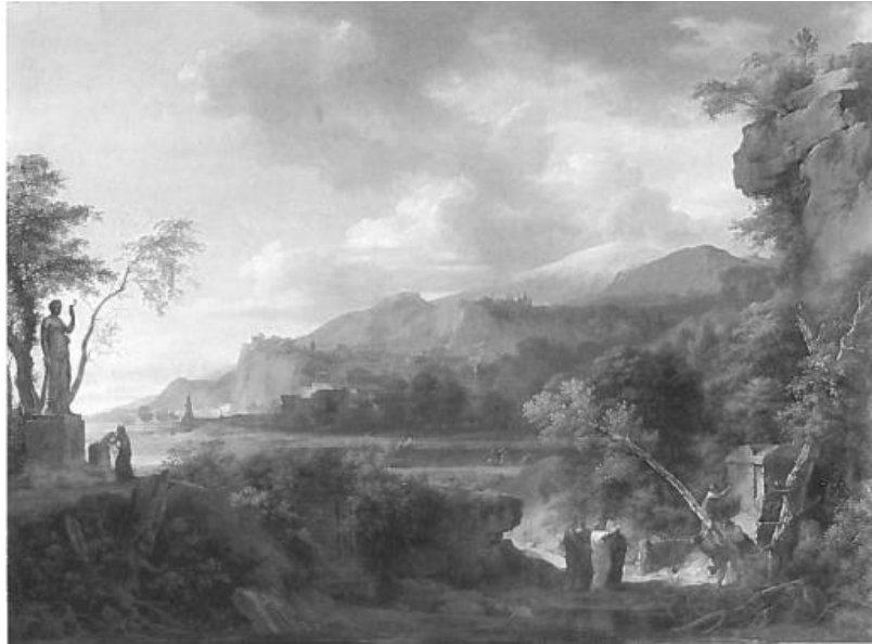
Figure 24 Pierre Henri Valenciennes, Cicero Discovering the Tome of Archimedes , 1787. Oil on canvas. Musée des Augustins, Toulouse.

Sarazin de Belmont would use figures similarly in her landscape settings, as will be examined further in Chapter 4. Valenciennes created a rich environment in which to set his figures. His towering mountains surround the figures and a distant town may draw the attention of the view's eye. The tomb and the presence of man in the landscape seems secondary.