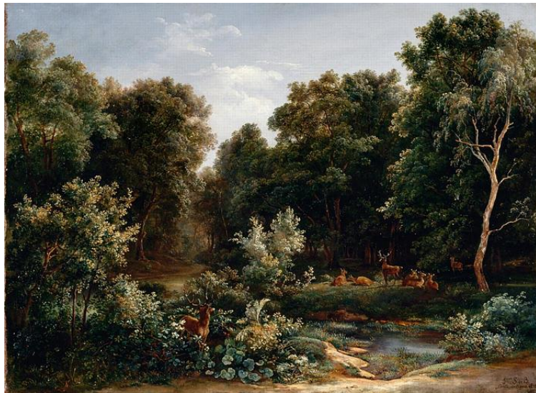
Figure 9 Louise Josephine Sarazin de Belmont, Intérieur de la forêt de Fontainebleau , c. 1834. Oil on canvas. 44 x 60 cm. Musée des beaux-arts, Nantes. 25