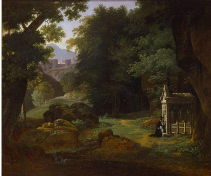
Figure 30 Louise Josephine Sarazin de Belmont, Scenes from the life of Jeanne of Navarre, duchesse de Bretagne (set of two), c. 1830. Oil on canvas, 54 x 64.7 cm. Wengraf auction house.