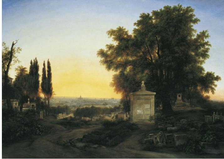
Figure 35 Sarazin de Belmont, Vue de Paris , c. 1842. Oil on canvas, 140 x 198 cm. Musée des Augustins de Toulouse.

In 1862, Sarazin de Belmont donated three works to museums in western France. The Musée d'Angers obtained the View of Orvieto Cathedra ( Vue de la Cathédrale d'Orvieto ), c. 1861. The painting had been displayed at the Salon of 1861 before its donation. The scene depicts the Nantes Cathedral on a distant hill while two figures, in Renaissance costume, watch a young woman and child, clothed and seated in a position which recalls the Madonna of the Chair , by Raphael (Figure 36). The landscape surrounding the figures features a shepherd and sheep traveling down a sunken road into a valley. 115 The Musée d'Angers also received two generic landscape works, undated and simply titled “paysage.” The first depicts a scene of two monks rising from the shade of a large tree. The second also features a monk as its subject. This man holds an open book and pen while a winged allegorical figure places his hand on the shoulder of the monk. 116 The archival trail left by the work of Sarazin de Belmont is grounded in brief descriptions