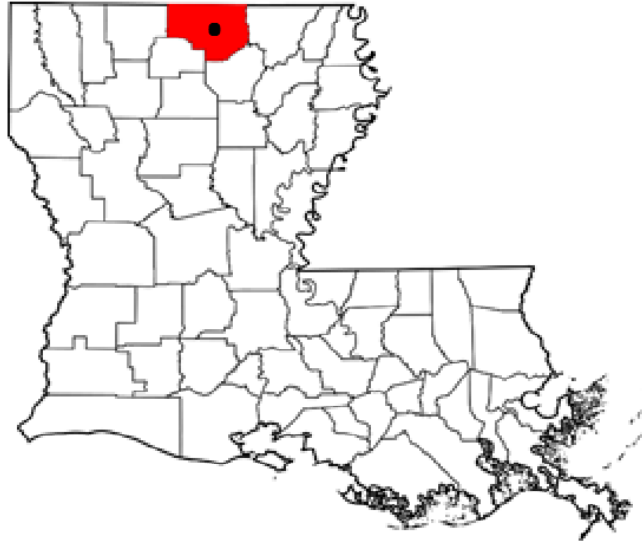
Figure 1. Location of study site chosen to investigate space use, survival, and habitat selection of white-tailed deer in industrial pine plantations in Union Parish, Louisiana, USA, 2009-2011.

The area was accessible through improved and unimproved roads including state highway 143, which bordered the eastern edge of the site. Bayou DeLoutre comprised the western boundary and Ford Road served as the northern boundary, whereas Phillips Ferry Road was the southern boundary. Buffalo Hole Road traversed the site as well as 5 other secondary roads. Traffic on all roads was light and localized.