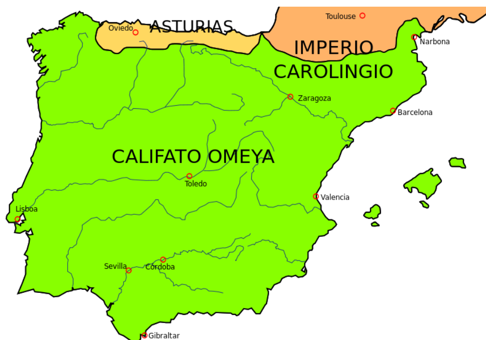
Iberian lands under Umayyad control (labeled as Califato Omeya ) in 750.

seeded itself in all aspects of Spanish life as the conquering troops dispersed and inhabited various regions throughout the peninsula. Though this initially created factions among first-generation settlers, it aided in the Arabization and Islamization of Spain's succeeding generations as each of these groups took slaves, intermarried with local families, hired Spaniards, and so forth. By the 9 th century, Arabic was widely used by the indigenous population and, as converts to Islam multiplied, cultures eventually merged into a new homogenous Hispano-Arab society (Lapidus, 379). Beyond religion and language, the Arab groups also brought forth economic progress through the introduction of eastern-style irrigation, creating more lucrative cash crops; a breakdown of Byzantine naval control in the western Mediterranean, allowing more prosperous commercialization and trade; and by creating a more consolidated political system (Lapidus, 379).