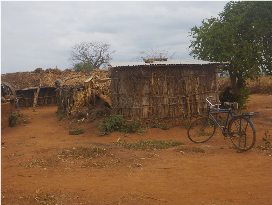
FIG. 3—Impoverished settlement near a park boundary. (Source: Photograph by the authors, June 2015). [Color figure can be viewed at wileyonlinelibrary.com ]

Although biased by racist and colonial attitudes, the travel accounts and ethnographies of the earliest Europeans to visit the Tsavo region can, with caution, provide vivid descriptions of people, elephants, and landscapes (Krapf 1860; Hobley 1895; Corfield 1974).