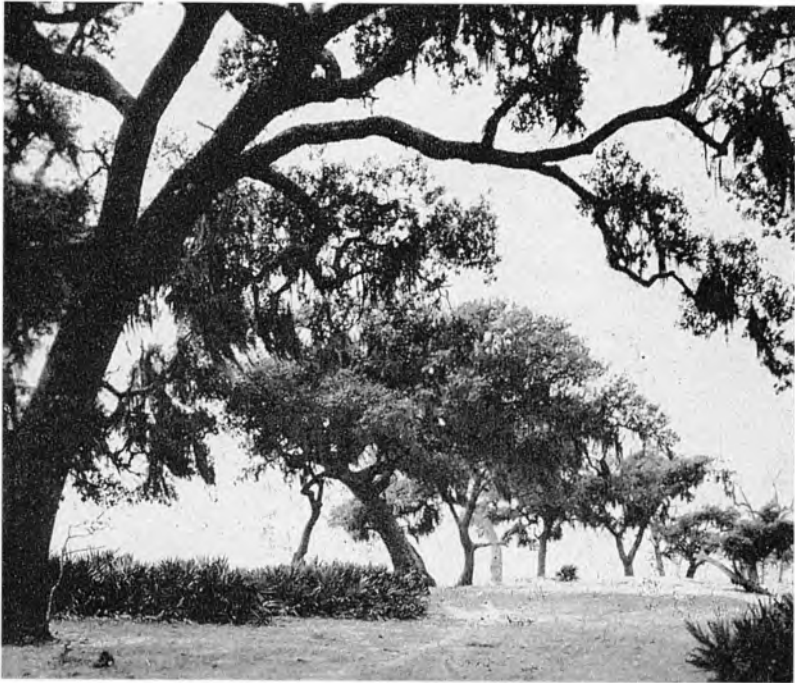
FIGURE 2. Live Oaks at Extreme Western End of Deer Island

of hardwoods and a sprinkling of slash pines and cypress ( Taxodium distichum ). Among these hardwoods the principal species are the evergreen magnolia ( Magnolia grandiflora ), the red bay ( Persea borbonia ), the swamp black gum ( Nyssa biflora ), the tupelo gum ( Nyssa aquatica ), and the water ash ( Fraxinus caroliniana ). In the wide stretches of pine woods the predominating undergrowth is the gallberry ( Ilex glabra ) and the saw palmetto ( Serenoa serrulata ), with several species of oaks, notably the post oak ( Quercus stellata ) and the black-jack oak ( Quercus marilandica ), occupying the more open sites. Fringing the coast itself are large