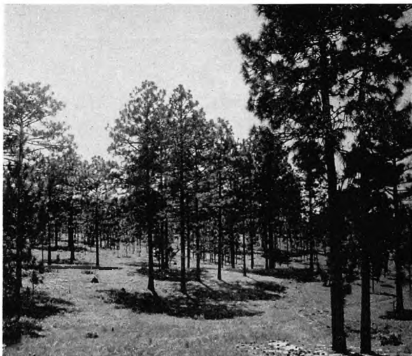
FIGURE 3. Typical Open Growth Longleaf Pine on Mainland

entirely by the slash pine. On both Petit Bois Island and Horn Island, each 16 miles from the mainland, there are but few live oaks, whereas on Ship Island and Cat Island, there are numerous groves of these trees. On Deer Island the live oak reaches a size equal to that attained on the mainland and is well distributed over the island. Deer Island is readily accessible since at its closest point it lies less than a mile offshore. It has been inhabited for many years by several families that live at the extreme western