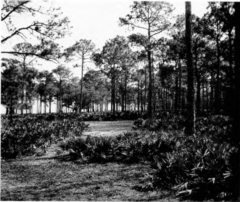
FIGURE 1. View of Deer Island Showing Open Pine Woodland

The three coastal counties of Mississippi are representative of the coastal plain that borders the Gulf of Mexico from the Atlantic coast westward into Texas. The topography is level to gently rolling, with an elevation of approximately 20 feet above sea level at the highest point. On the mainland there existed originally an almost unbroken stretch of open forest in which the principal species was the longleaf pine ( Pinus palustris ). At the present time very little of the original forest remains, unrestricted logging