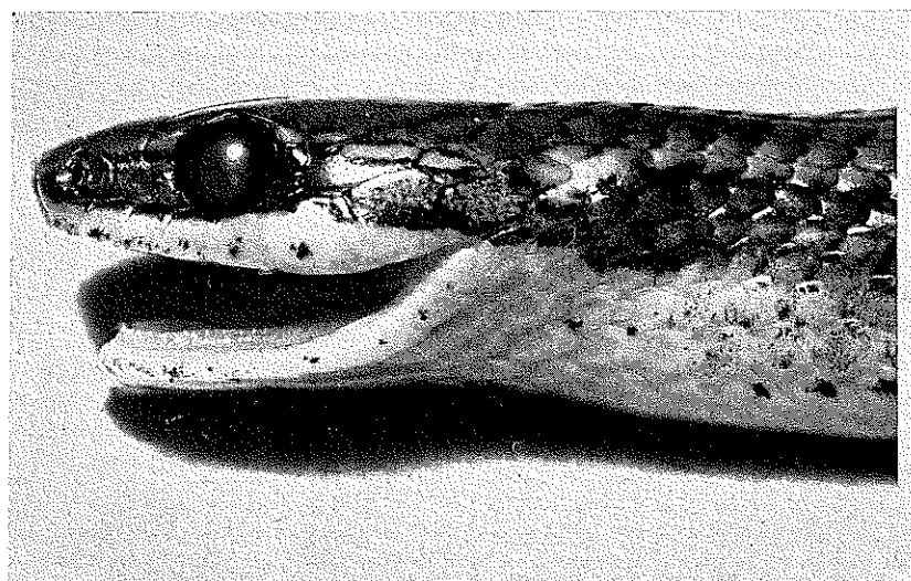
FIGURE 1. Lateral view of head of Rhadinaea myersi holotype, collected 3 miles N Pluma Hidalgo, Oaxaca, México.

Variation. —The paratype, a juvenile female, is essentially like the holotype. It has 139 ventrals and 72 subcaudals, and measures 185 mm in total length (tail 55). The only conspicuous differences in color pattern are the absence of light parietal spots and the persistence of a faint dorsolateral light stripe on row 5 throughout the length of the body and onto the tail.