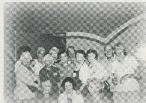
WE DID IT! It's all over. See you next year!