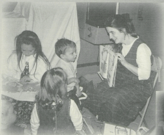
The magic of books