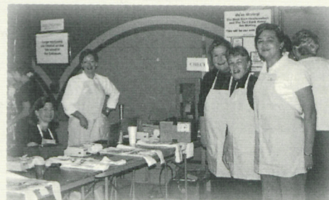
"Open the doors" say the volunteers.