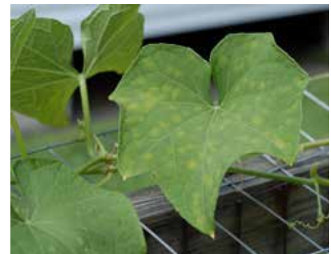
Figure 3. Chayote powdery mildew.