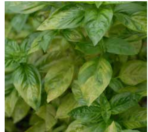
Figure 2. Sweet basil downy mildew.