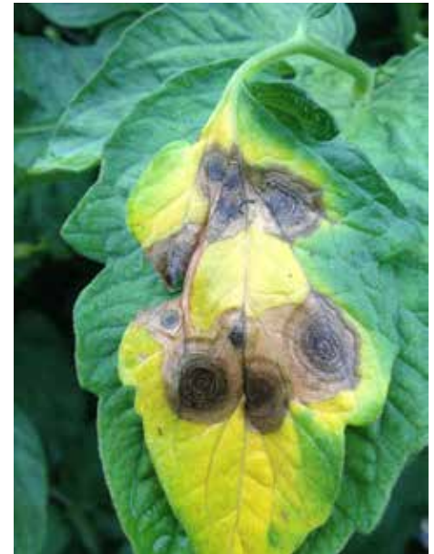
Figure 1. Tomato early blight.

Phytophthora root rot. Root and crown rots commonly affect plants in the home garden, particularly those in poorly drained sites with compacted soils. The first noticeable above-ground symptoms generally include wilting of the leaves, especially during the heat of the day, and stunting of the plants. Additional