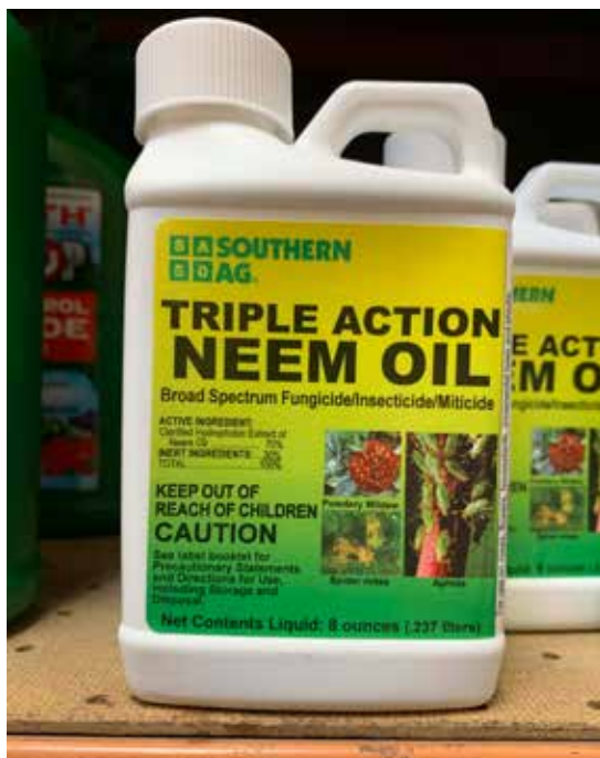
Neem oil is a contact pesticide for insects and fungal disease.