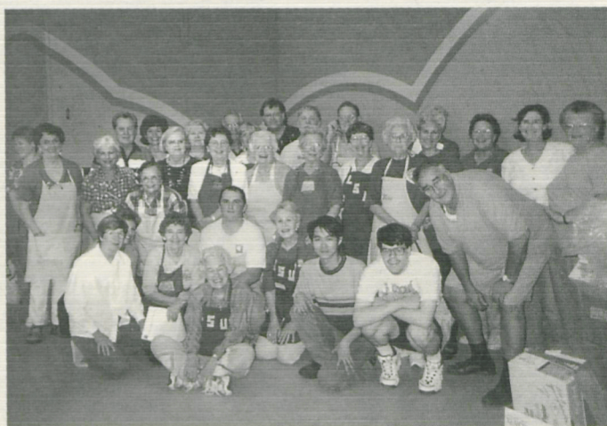
It's all over, "and so to bed." (Samuel Pepys)