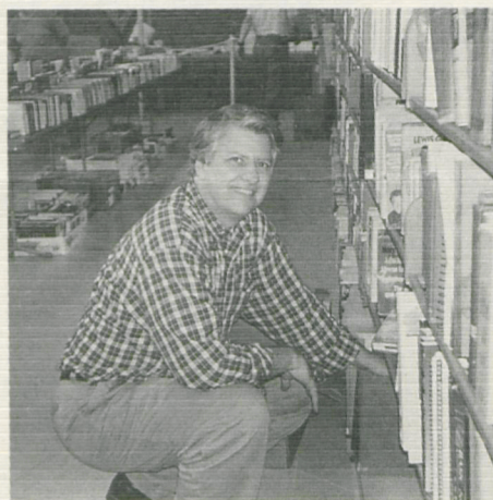
President Gene Groves quickly learns the routine—wheel a heavy dolly, lug a load of books, and put them on display.