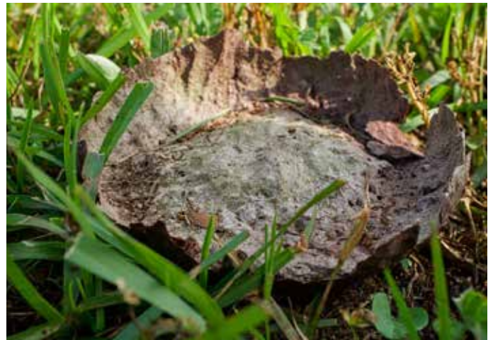
Slime molds, puff balls, mushrooms and other fungal fruiting structures are frequent landscape visitors. In general, most are not plant pathogens and their presence should not cause concern.