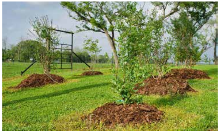
The blueberry mound planting method allows growers to grow blueberries virtually anywhere on the Cajun Prairie. Using soil amendments like pine bark, peat moss and sand will acidify the soil, improve drainage and add needed organic matter for good growth.