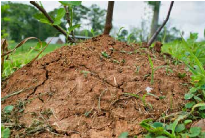
Fire ant mounds in the garden can be a real nuisance and detrimental to plant development. Not all ant control products are labeled for use around gardens and trees producing edible fruit. Read product labels carefully to determine proper use recommendations.