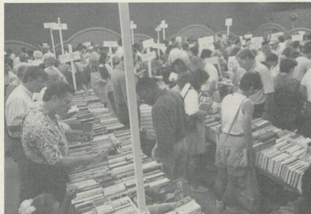
Hubbub of the Book Bazaar