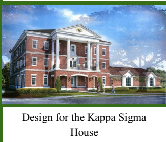
Design for the Kappa Sigma House

Those who inhabit Parnassus howled in horror at the discovery that the Muse of Architecture had once again disappeared during a last-ditch remediation visit to the LSU A&M campus. Those who have seen the latest pair of designs approved by the LSU Board of Supervisors can only assume that they were scribbled out in a state of confusion while scrambling after missing inspiration. First among the astounding gaffes was the design for the new Kappa Sigma Fraternity House, a design which not only celebrates the not-so-good old plantation days but that, in its attempt to enlarge neoclassicism to a colossal scale, looks like a nightmarish attempt by Benjamin Franklin to build a super-hangar for a scaled-up Lightning Kite version 2.0. Add to that a wing that looks rather like a boat shed in the Santa Maria subdivision and, voila, disproportion rules. Less amazing owing to its embrace of the plain vanilla school of architecture is the design for the LSU Tiger Athletic Nutrition Center (AKA “Gladiator Pre-Concussion Feeding Station”), which not only draws on but draws out the Mussolini-inspired, historically nostalgic architecture of the LSU quadrangle, stretching the main campus look into an eating mall with the same proportions as a strand of uncooked bucatini. Further complicating this exercise in unimaginative simplicity is a series of mirrors that, rather than encouraging the dining athletes to reflect, deflects light back on to excluded passers-by.