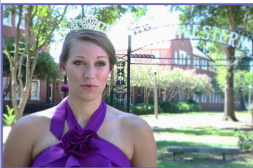
Beauty Pageant Contestant— Northwestern video