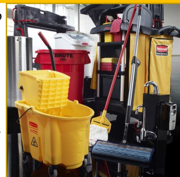
Vendor Sweeps Away Past Errors

Users of LSU A&M’s GeauxShop purchasing system waxed rhapsodic over the “vendor expo” that brought together not only Office Depot representatives but the mysterious people who make all those Rubbermaid gadgets and even a few plumbing experts. With the takeover of OfficeMax by Office Depot, an array of new purchasing options will open and, better, a new ordering interface and system will upend the old, incompetent OfficeMax offering. Applause to the arrangers of this event—and let’s hope that the splendid Rubbermaid catalogue, with all its astounding cleaning tools, will upgrade maintenance on our campuses!