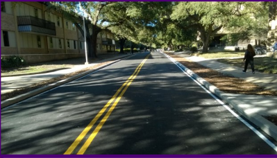
Tower Drive After the Metamorphosis

on Nils Bohr and his followers by creating an entire pedestrian zone that flips in and out of our space. Last fall, LSU A&M experts sealed off a section of Tower Drive that passes by an assortment of science-purposed buildings. For a time, this newly created pedestrian zone, buttressed as it was by formidable bollards and even a few planter boxes, became a shrunk version of Austin's South Congress Street, what with a pair of food trucks serving the needs of the nearby STEM community. Then, in January, while everyone was busy perusing the cool sable night sky, an assortment of mechanical juggernauts arrived, ripped out the barriers, re-paved the street, added brilliant orange lane striping, and lined the result with broad planter boxes filled with mulch and nothing else. Yes, despite looking like a new superhighway, no car has dared ply this boulevard. To top it all off, a radio tower has suddenly appeared atop the nearby science buildings. Could this strange vacillating street, with its long