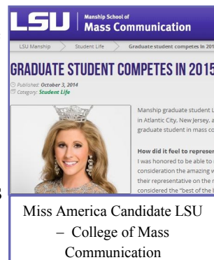
Miss America Candidate LSU — College of Mass Communication

only one woman occupies a top campus- or system- careful about the images of women that they allow would expect that campus chiefs and college deans colleagues pursuing the life of the mind or other- Newsletter reader will reel in amazement to discov- decorated or decorative women to promote assorted his inauguration, incoming Northwestern Louisiana head of Bossier Parish Community College, includ- an evening gown and wear- tiara, as if Nathcitoches were As if to drive home the sequently appeared in a pic- ture in which his wife toted a gigantic spray of flowers, apparently having just then skated off the Olympic ice. Looking a bit farther south, the College of Mass Communications (the Manship School) at LSU A&M inserted, into its self-scrolling web page, a view of its own entrant into the Miss America competition, who joined the statewide cadre of crowned heads. Progress, adios!