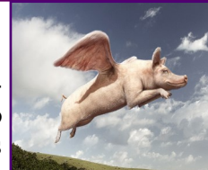
Inscrutable Airborne Phenomenon Over AG

Newsletter readers have followed the case of the disappearing simulation meat display case: the behemoth eight-foot exhibition mockup that could not make its way into the new LSU A&M Agriculture Laboratories building and that was whisked away to an undisclosed location once the embarrassment began making administrator cheeks as pink a prosciutto. In an event worthy of Area 51, the on-again off-again meat case returned from the air as a crane pulled up out of nowhere and lowered the airborne bogey into the upper reaches of the Agriculture compound, where burly men-in-black-sausage-style-apparel quickly whisked it into a laboratory. Will Stanton Friedman be called to investigate?