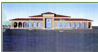
Design for the Tiger Athletic Nutrition Center

Those who inhabit Parnassus howled in horror at the discovery that the Muse of Architecture had once again disappeared during a last-ditch remediation visit to the LSU A&M campus. Those who have seen the latest pair of designs approved by the LSU Board of Supervisors can only assume that they were scribbled out in a state of confusion while scrambling after missing inspiration. First among the astounding gaffes was the design for the new Kappa Sigma Fraternity House, a design which not only celebrates the not-so-good old plantation days but that, in its attempt to enlarge neoclassicism to a colossal scale, looks like a nightmarish attempt by Benjamin Franklin to build a super-hangar for a scaled-up Lightning Kite version 2.0. Add to that a wing that looks rather like a boat shed in the Santa Maria subdivision and, voila, disproportion rules. Less amazing owing to its embrace of the plain vanilla school of architecture is the design for the LSU Tiger Athletic Nutrition Center (AKA “Gladiator Pre-Concussion Feeding Station”), which not only draws on but draws out the Mussolini-inspired, historically nostalgic architecture of the LSU quadrangle, stretching the main campus look into an eating mall with the same proportions as a strand of uncooked bucatini. Further complicating this exercise in unimaginative simplicity is a series of mirrors that, rather than encouraging the dining athletes to reflect, deflects light back on to excluded passers-by.