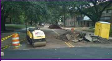
Tower Drive During the Metamorphosis

Fans of popular science are familiar with the now aging observation that, in the world of quantum mechanics, particles may fluctuate in and out of existence. In its perpetual quest for quality, LSU has upped the ante