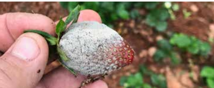
Diseased berries should be picked and removed from the garden and fungicide sprays with products like Captan can be applied to reduce incidence levels.