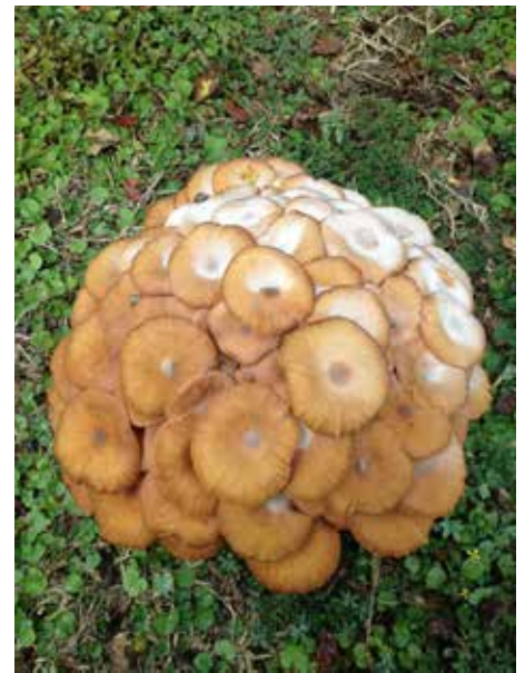
Cluster of honey-colored mushrooms produced by Armillaria sp.