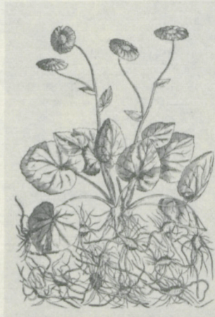
Mattioli woodblock, leopard's bane ( Doronicum plantagineum )

The long-awaited Mattioli woodblocks have arrived! Thanks to the Friends, two woodblocks originally used to illustrate an important sixteenth-century herbal are now showcase items in the E.A. McIlhenny Natural History Collection.