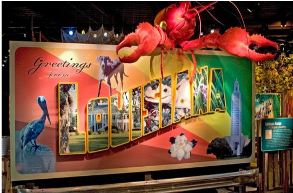
Lunchtime Lagniappe, a popular weekly series of lectures that explores the rich culture and history of Louisiana, resumes March 5 at the Capitol Park Museum in downtown Baton Rouge.

The following four programs are scheduled for Wednesdays in March: