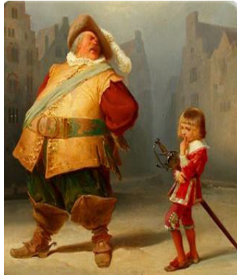
Falstaff and Prince Hal wonder whether humanistic knowledge opens career paths.