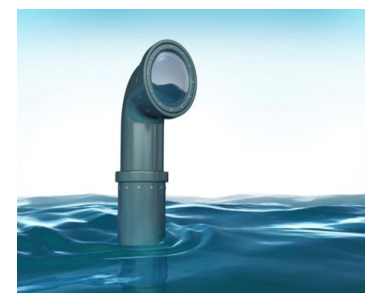
Low profile strategy does not conceal Water Campus Problems.