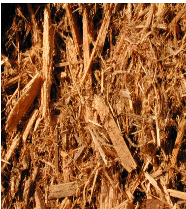
Pedestrio exits the parking structure and lands in the bagasse.