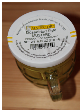
One of many Düsseldorf mustards in the Löwensenf tradition.

Earlier in this feature, modulated mustards with too many additives were cashiered from the ranks of beaten brassica beads. Admittedly, however, there is an honorable tradition of mustards in which minuscule additions of assorted aromatics yields a product that is greater and more useful than the sum of its components. Without question, the chief among these modulated mustards is the world-renowned Düsseldorf mustard, in which an admixture of carefully curated horseradish extends the rush of mustard flavor into a full-fledged gallop. Whereas an overproduced product such as Grey Poupon can inadvertently fall into a cheap horseradish pungency, Düsseldorf mustard uses only comparatively sweet horseradish varieties that confer an undefinable but intensely pleasing (if also occasionally fiery) taste and that empower an unparalleled olfactory experience. Today, Düsseldorf mustard is available in two lineages. Purists can relish the original Düsseldorf Löwensenf (Düsseldorf Lion