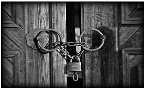
Faculty Entrance, Board of Regents search firm selection room.

In the same meeting, the Board of Regents approved the use of $12,000,000.00 putatively private money to build a great Temple of Fundraising on the site of the former Alex Box Stadium. Perhaps, after the completion of that project, the Regents might get around to the provision of hot water and working fixtures in academic buildings.