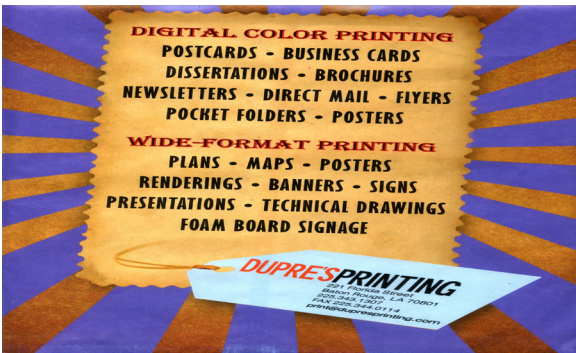
Dupree Printing Courtesy Bag