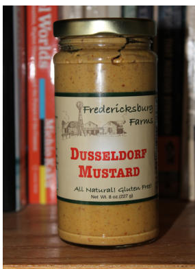
Fredrick's American-Style Düsseldorf

Mustard), which will knock off the proverbial socks but which can play a dazzling role in such classic compositions as a carrot-dill salad. Those of milder, new world tastes can try to delicious interpretation offered by Fredericksburg Farms, a fine food purveyor in the German cultural district of Texas. The Fredericksburg Farms version tones down the lion-like heat of the archetype and brings out more of the earthy bouquet, with the result that it becomes superbly useful in vinegar-based salad enhancements.