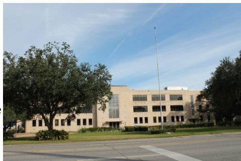
Kaufman Hall, McNeese State

For better or worse, Louisiana abounds in superb examples of the low-budget futurist style practiced by the Works Progress Administration. Although the Newsletter laments the reluctance of state design officials to experiment with new architectural idioms, it is also applauds the respect shown for those building that, despite their lack of modern efficiency, continue to ornament our campuses as they transition into the "historic" category, in some cases even making it onto the National Historic Register. For the last several months, McNeese State University has sedulously renovated its behemoth, WPA-developed Kaufman Hall , the original, core edifice around which the McNeese campus gradually emerged. Then, just as faculty were returning to this heavyweight and increasingly historic pile, a heavy construction vehicle rumbled over and cracked a pipe buried to close to the surface, with the result that the Kaufman basement flooded, doing the predictable damage to electrical and other accoutrements. This artificially induced, quasi-seismic catastrophe has shuttered Kaufman Hall at least until the upcoming semester. Good luck to the "Cowboys" in the restoration of this bulky architectural gem.