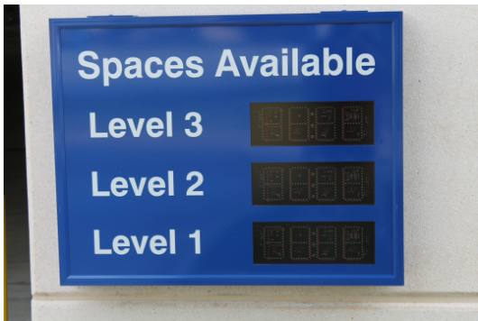
Above: McNeese traffic counter goes tilt Left: McNeese finds artistry even in parking