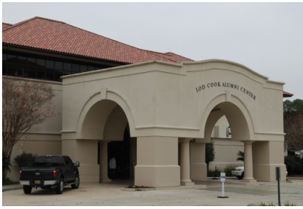
Affordability confab convenes at Cook Center