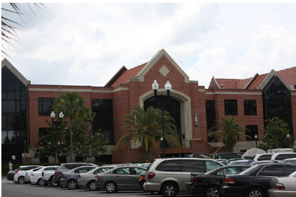
UF Criser Hall--more persuasive than any CV