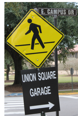
Parkers sit still but parking signs move

More than a few colleagues have noticed that the new parking structure on the LSU A&M campus has been less than overpopulated. In addition to the necessity of estimating parking time and paying in advance, parkers looking at this cavernous edifice have been deterred by safety concerns. But the shortage of parkers may arise from one of the more entertaining gaffs in the history of public structures. It seems that installers have set directional signs too far for the road, with the result that, before finding the parking structure, drivers must first find the information signs. Zeal for the architectural integrity of the campus seems to have worsened the situation as visitors seeking the familiar bright blue "P" sign eventually encounter only dark brown, non-standard signage. There is, however, a happy if costly end to this story. In a move unprecedented since, in Shakespeare's Macbeth, the Birnam Forest walked over to Dunsinane, a new team of experts will relocate the signs to positions in view of the road.