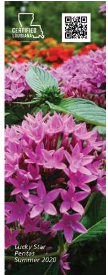
Lucky Star Pentas Summer 2020