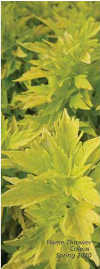
Flame Thrower Coleus Spring 2020