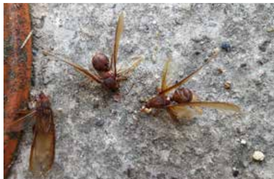
(Left) A recent photo of reproductive winged town ants.