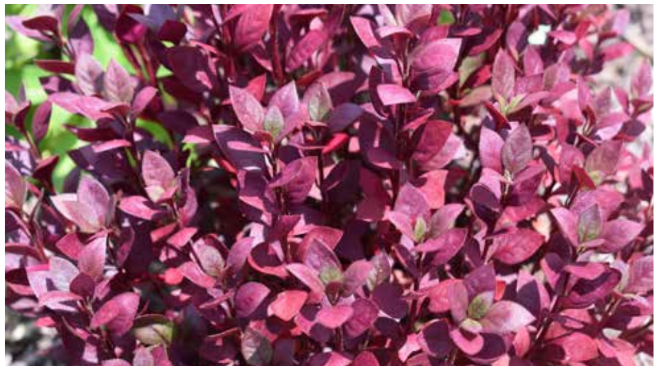
Little Ruby Alternanthera grows in the Louisiana Super Plant demonstration bed.