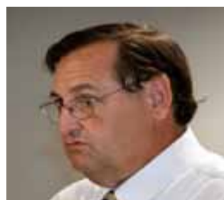
A G Monaco

For those of us who are public employees in higher education we received a "double hit" during the last four years - salary growth has stalled and our market based pension accounts have declined in value. (continued on page 7)