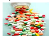
Colorful Health Care