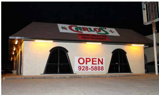
Carlos Mexican Restaurant

Least familiar to Baton Rougeans are the taquerias and similar, often pop-up, eateries that often cater to genuinely Mexican and Central American diners. Entering these establishments can be an exciting or perhaps slightly intimidating experience.