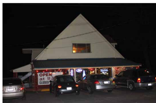
El Rio Grande

Some of the long-runners among the pseudo-Mexican-restaurant tribe—"pseudo," because it is not clear whether they have any Mexican heritage or even kitchen staff—manage to rise above their pale origins and to strike an interesting note if not a full chord. For many years, Las Palmas, which, of all things, began with Arabian owners, offered the closest approximation of the American southwestern version of Mexican fare to be found in Baton Rouge. Day in and day out, Las Palmas continues to sustain its loyal clientele, presenting decent if unimaginative renderings of the canonical Mexican dishes and combination plates. Up on Government Street, not too far from Our Lady of Mercy Catholic Church, Superior Grill pumps out thousands of tasty but not especially startling plates, making enough use of tomato and cilantro to pass as sort of near-Tijuanan while packing in its main clientele: lunching businessmen looking for the big meal that eludes them in a health-conscious home or, in the evening, singles on the prowl and other persons seeking action under the piñatas.