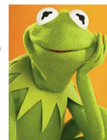
Diversity: It’s Getting Easier to be Green

Heeding criticism in past issues of the Newsletter, LSU’s Equity, Diversity, and Community Outreach Department has introduced a highly visible icon to illustrate that diversity really can be diverse and that international origins can ennoble an institution. The inner back cover of the latest annual report on diversity introduces a green icon—in the color of “go,” as in “go ahead and go for it”—that emblemizes the 3% of the student body who hail from international origins. Also mentioned are the 4.2% of faculty members who hail from foreign shores. Admittedly, those numbers are small, but the recognition that internationalism merits as much attention as do other forms of diversity is a step forward (even if it still isn’t very easy being green).