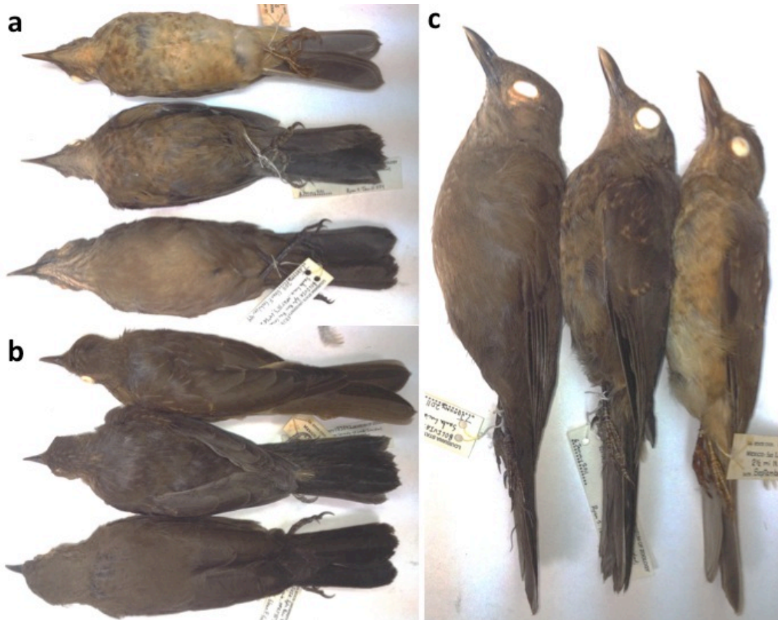
Figure 2: Juvenile Turdus haplochrous in center compared to adult Turdus haplochrous collected in Santa Lucia (bottom in a and b, left in c) and a juvenile Turdus grayi from Mexico (top in a and b, right in c).

Juvenal Plumage description: As with many species in the family Turdidae (Collar 2005), the juvenile plumage was characterized by overall dull brownish coloration with bright buff tips to the rachi of the body feathers and coverts. Juvenile specimens of Turdus sanchezorum were not available for comparison, but a specimen of Turdus grayi in juvenile plumage was similar but more olive in the upperparts, and much paler throughout the underparts, with similar patterning overall. Capitalized color names follow Ridgway (1912). Soft part colors were taken in the field and are not capitalized. Crown Sepia, with very thin Ochraceous-buff rachi and tips at rear crown, extending onto nape and back. Back deep olive. Throat Olive-buff. Breast and belly Tawny-olive with interspersed Cinnamon-buff and Sepia smudges. Scapulars Deep olive with Cinnamon-buff rachi. Greater, median, and