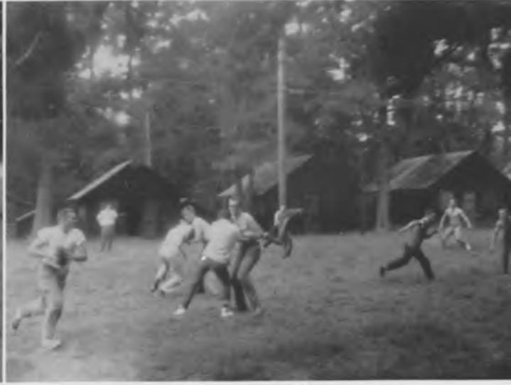
McCoy won't drop the ball!!