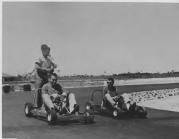
"You ready, Bomber?"