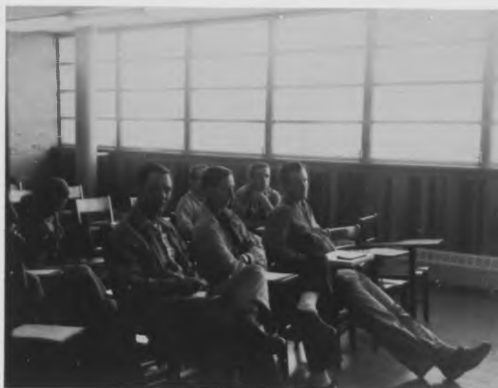
"Know It All Wisp," asleep?