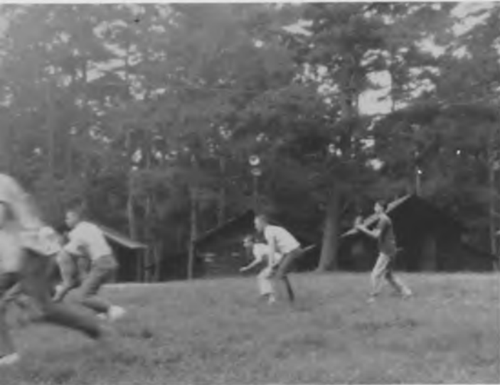
"Hawk" back to pass