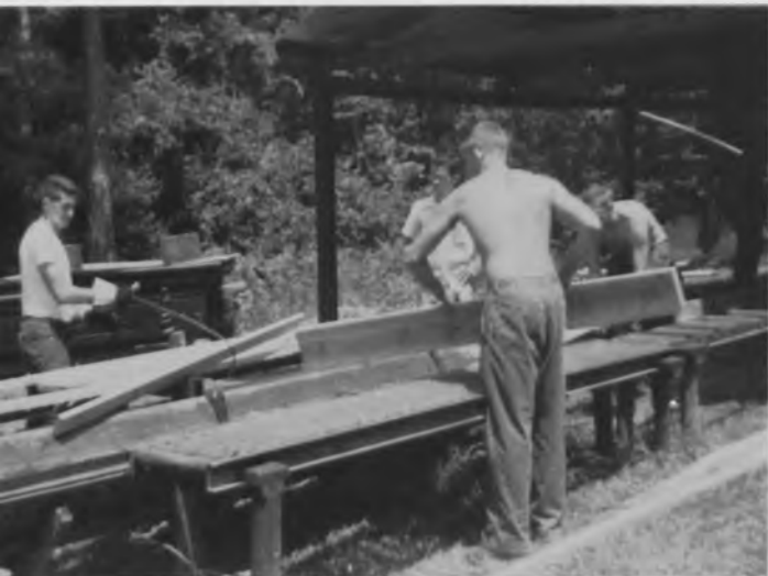
"This is how we do it in Ala."