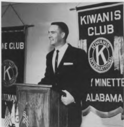
conservation, public relations