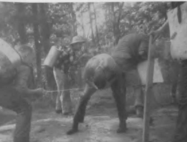
Put out that fire!