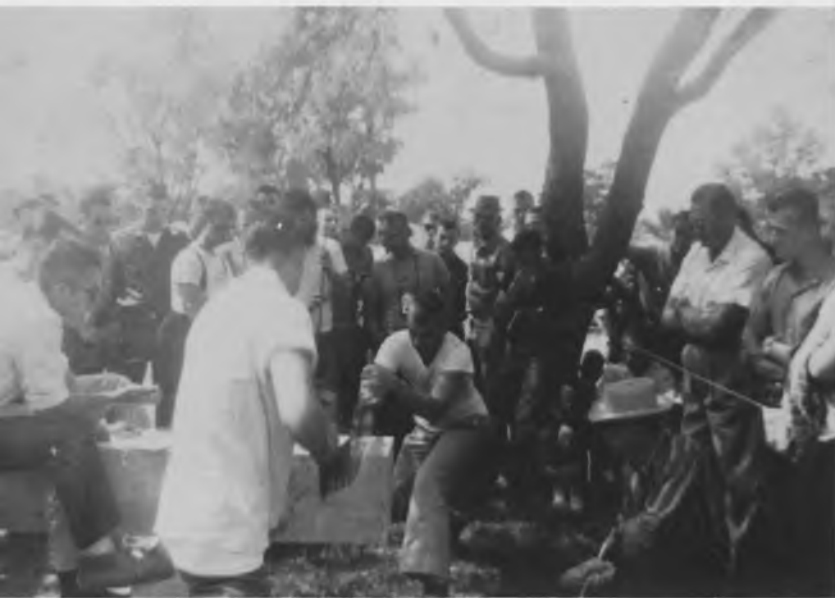
The start - 3:00 P. M.