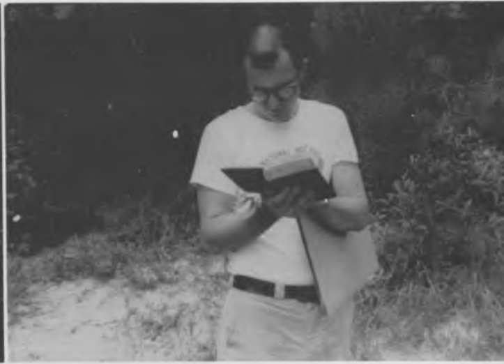
Frustrated game man