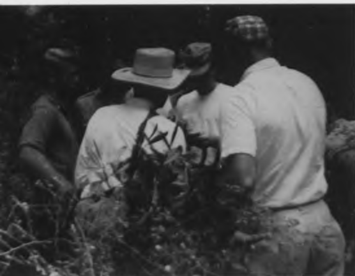
I give up! What is it?