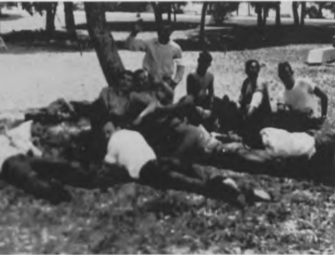
Soakin' the Fla. sunshine