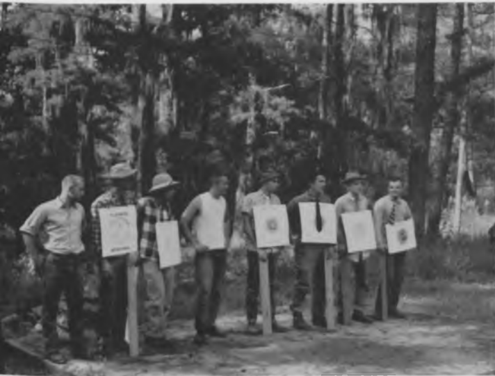
The motley crew