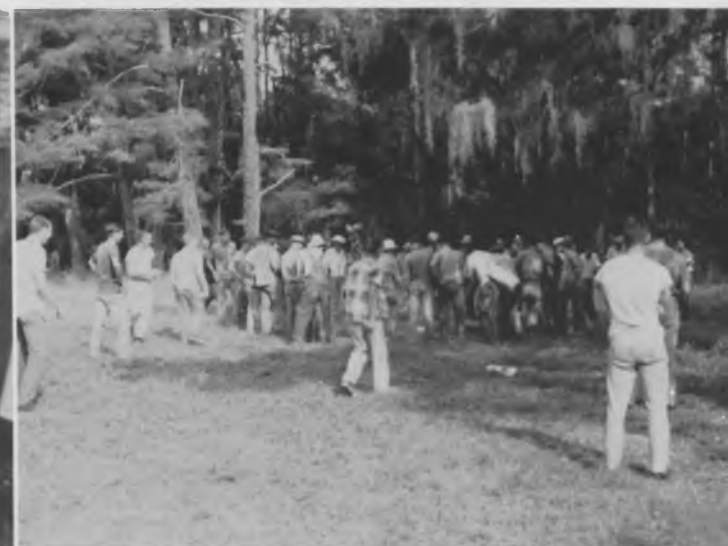
Let's have a skunk-catch!