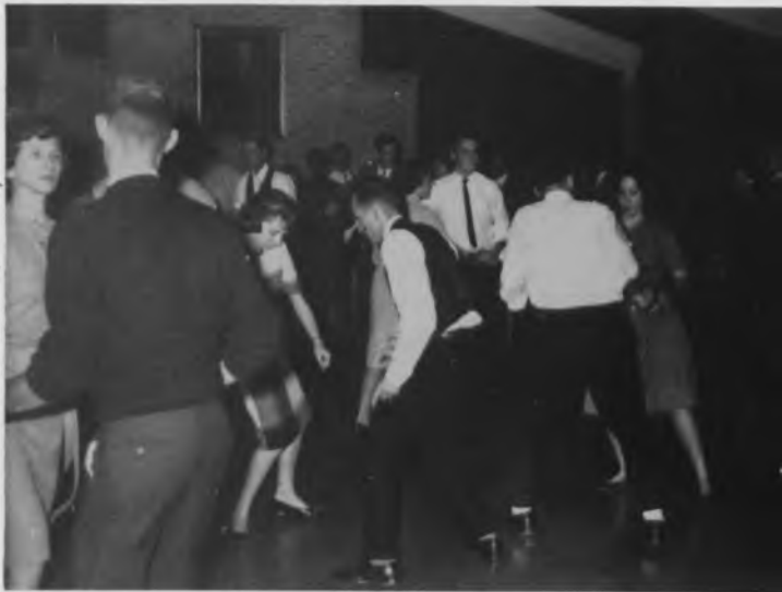
"In full swing"