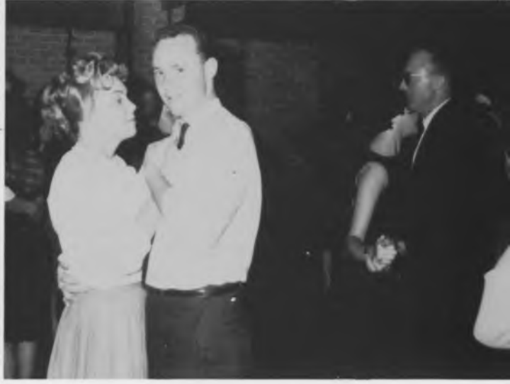
Sanders and Company