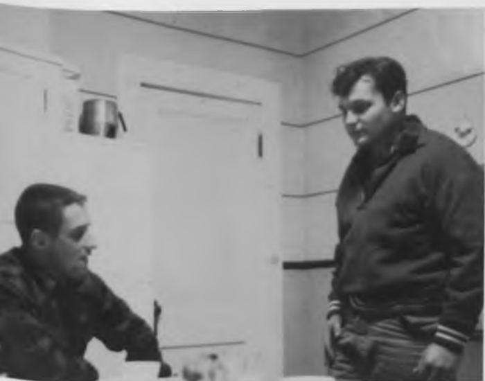
Radical Party Strategy