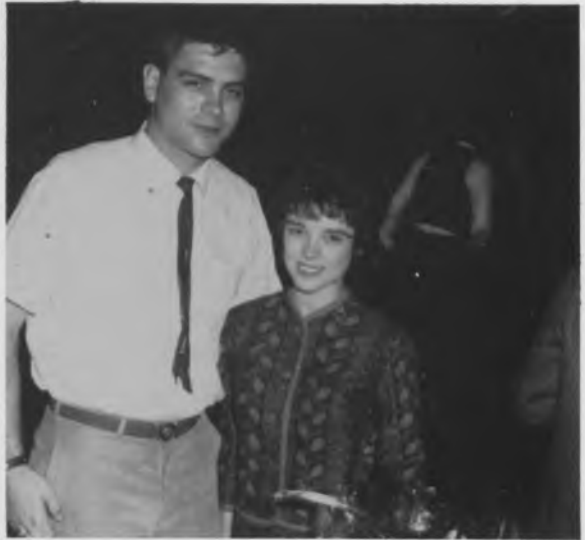
Some people did nothing but drink punch.