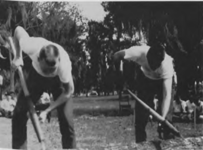
"Come on, Jools"