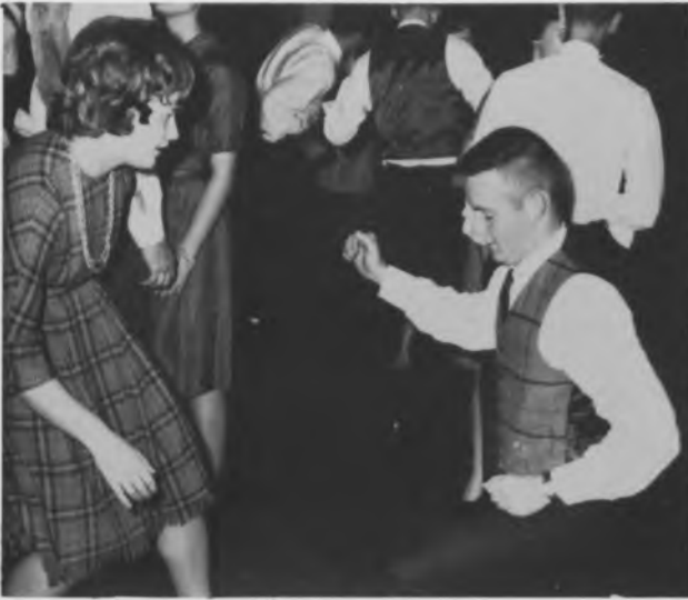
"Let me show you how to do it"