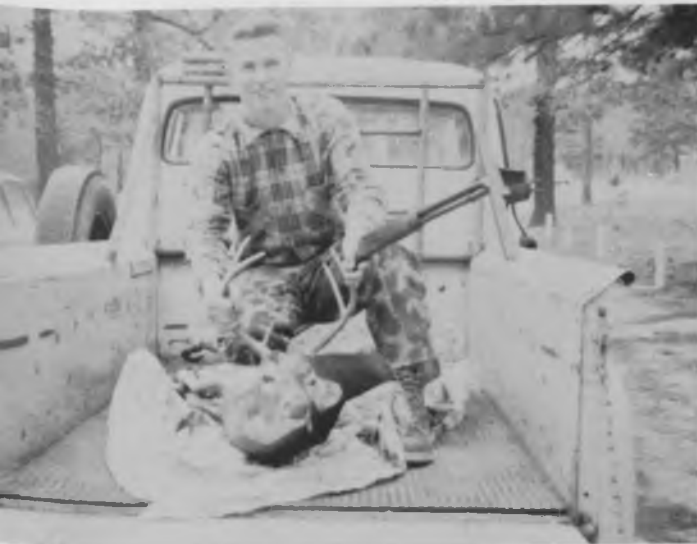
"Great White Hunter"