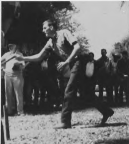
He pitches . . .