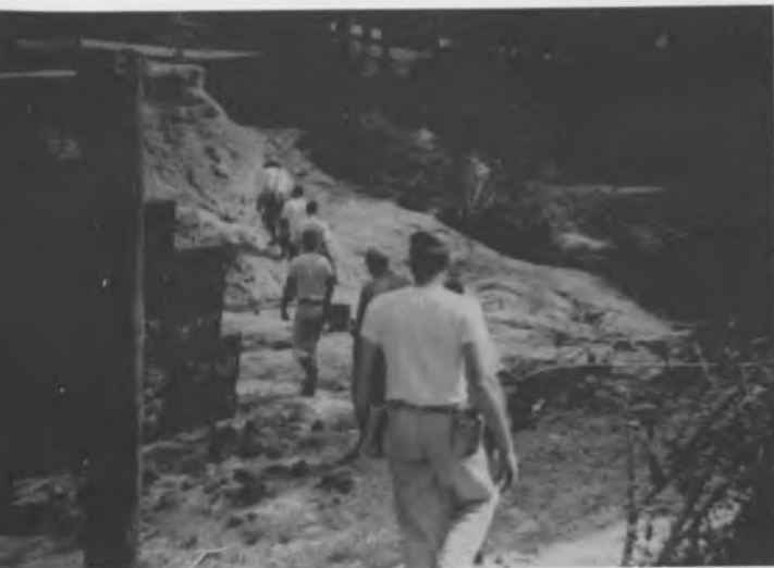
Over "Rough terrain"