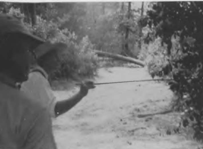
"Now, here is a yellow vined dodoberry"