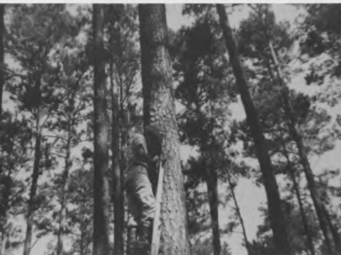
"Peckerwood" up a tree

This year's camp was characterized by the familiar "cut and leave" tests, "suds" at Capo's, rain and mud, yellow jackets, poison sumac, afternoon softball games, planned visits, long hours at the calculators, late night water fights, and mysterious voices from the woods.