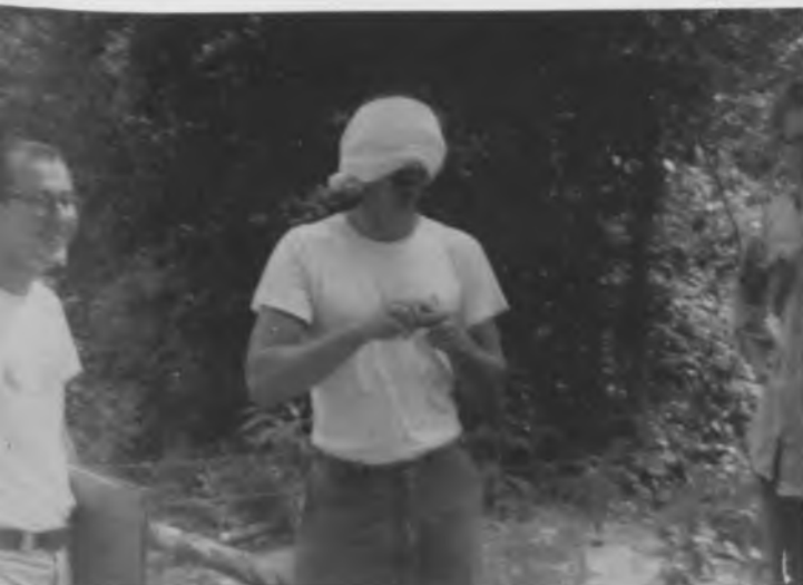
It SMELLS like poison ivy