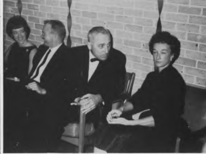
"What do you mean you can't Twist?"