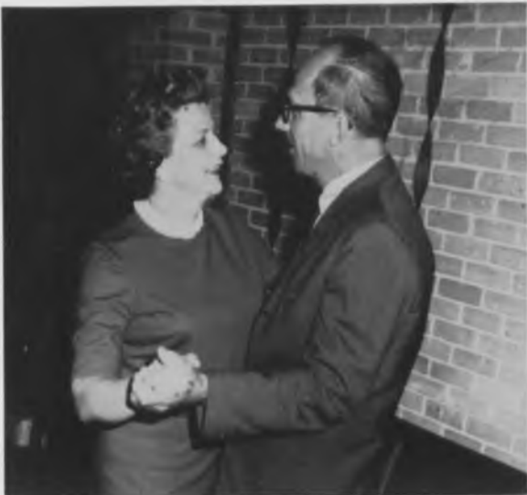
Now let's try it on the dance floor!