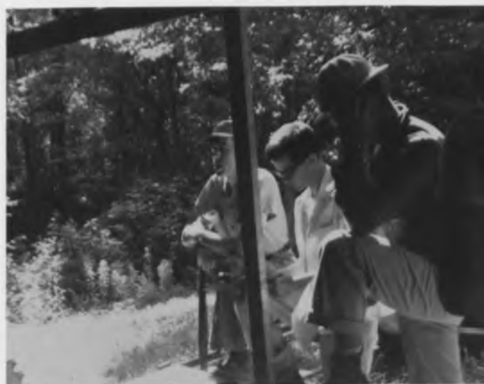
First, there's the saw.