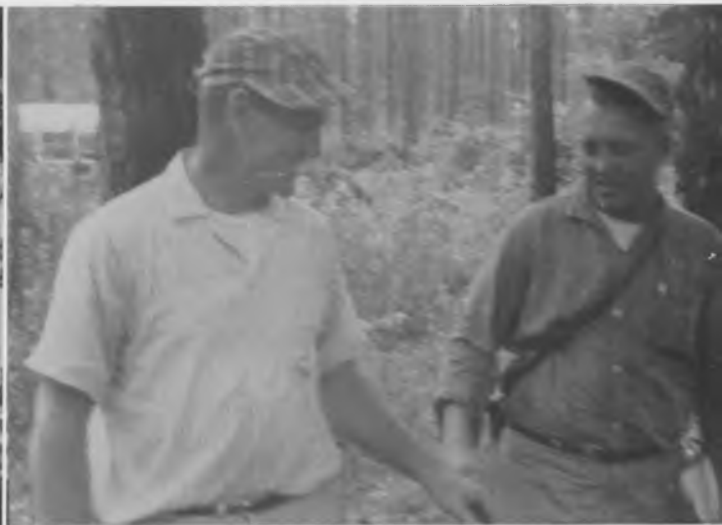
The "sugar twins" holding hands