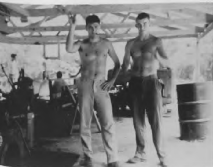
Tarzan and Jane