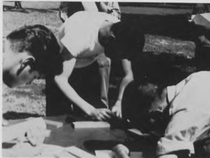
Wood tecking game man