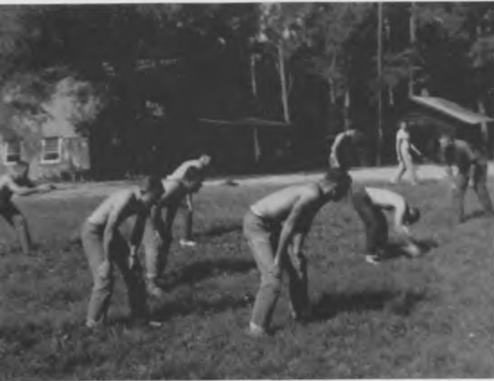
Shots of the Sawdust Bowl