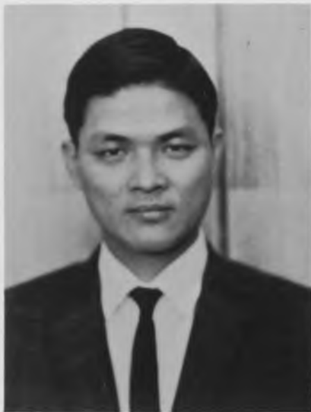
CHUNG YUN HSE Taiwan, China