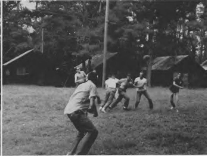
"Hawk" to "Big Daddy"