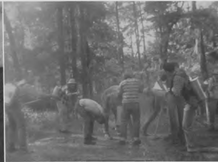
Why is he bent over like that?