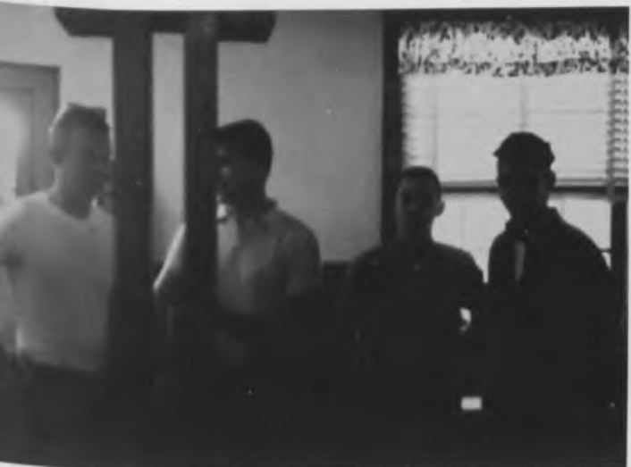
Let's get a cool one