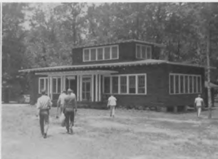
The troops goin t'house