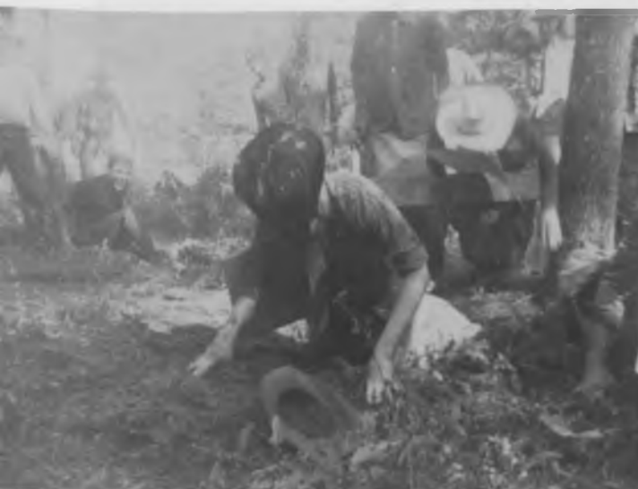
What a mess!