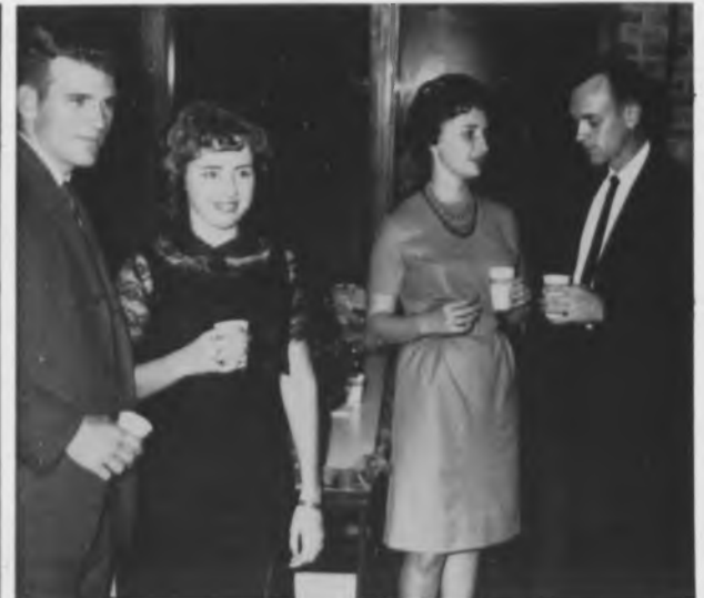
It's plain ole punch.