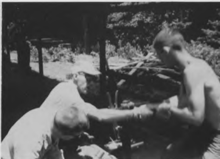
More harsh words