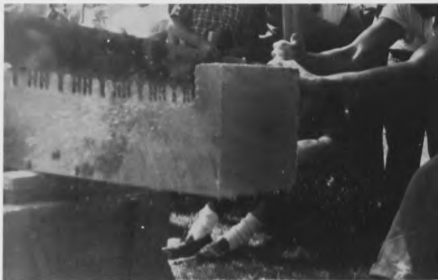
3:30 P. M.