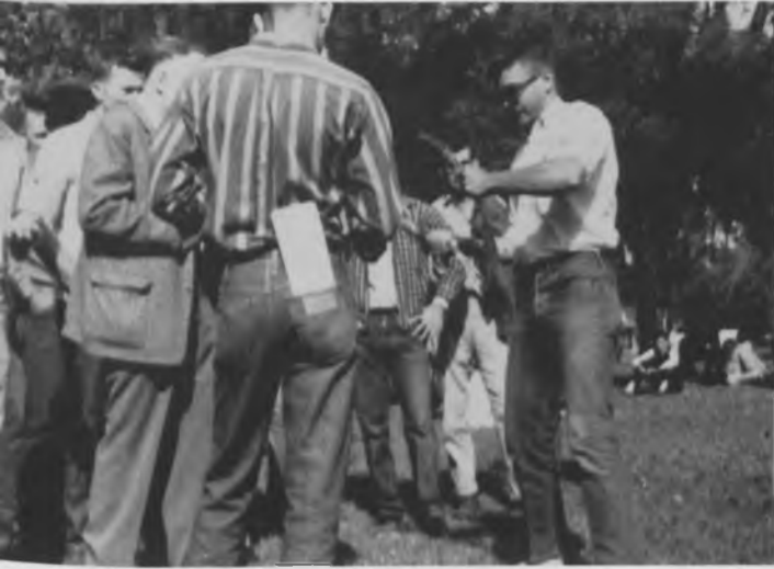
And then, you . . .