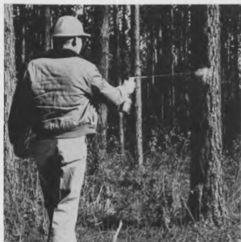
land management, timber sales