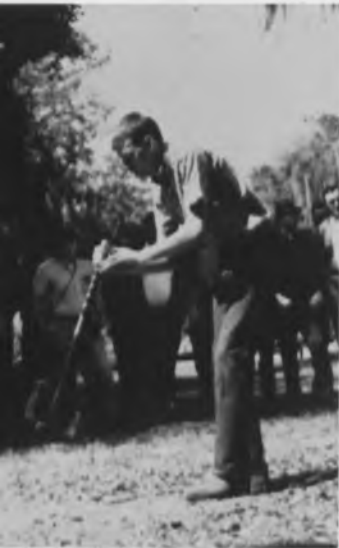
Daddy winds-up . . .