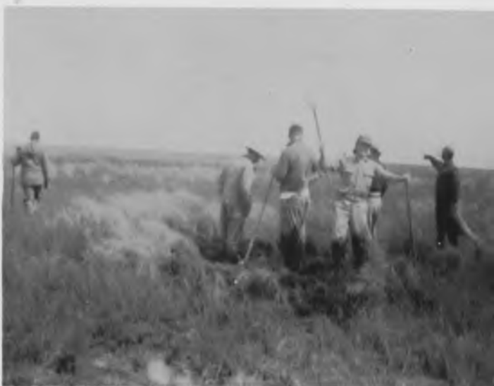
Muskrat Home Wreckers!