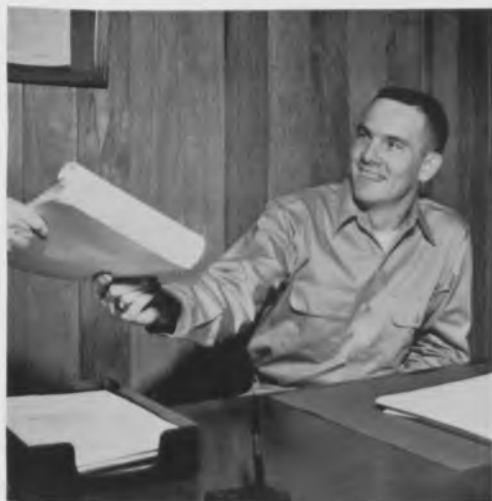
administration, personnel relations