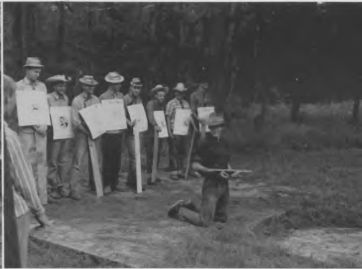
This year's yankee