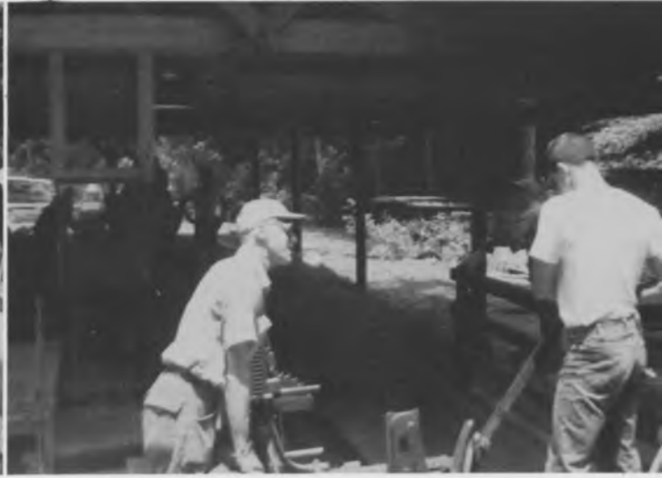
"Put the */#* thing on one"