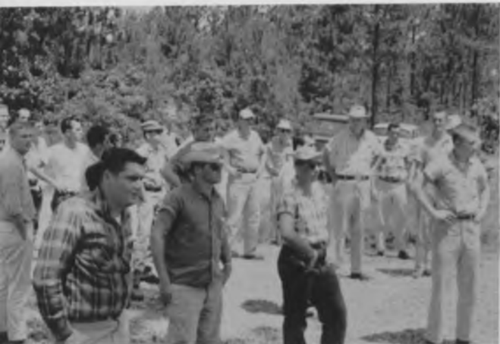
Anybody for booray?