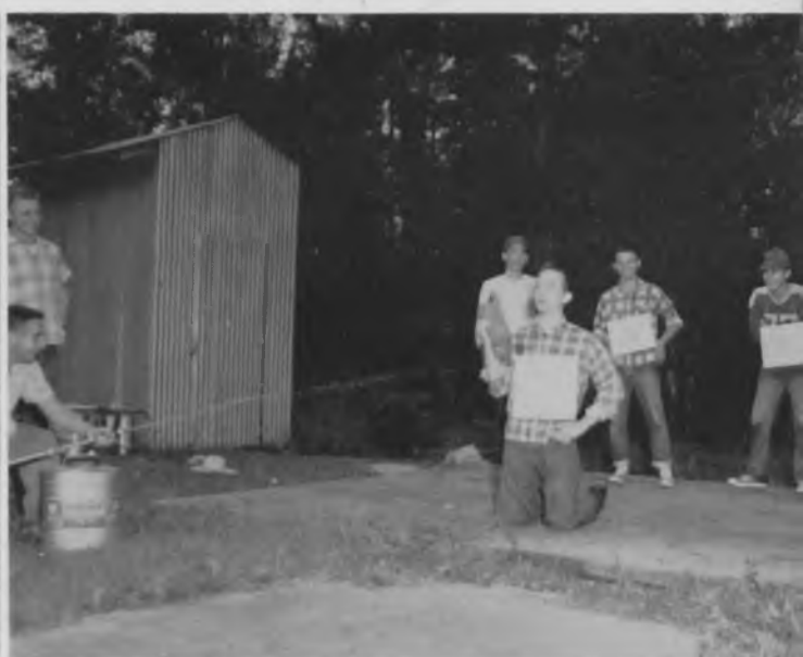
A yankee in the crowd!