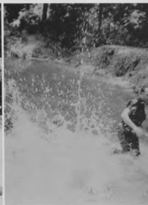
The Marines have landed!