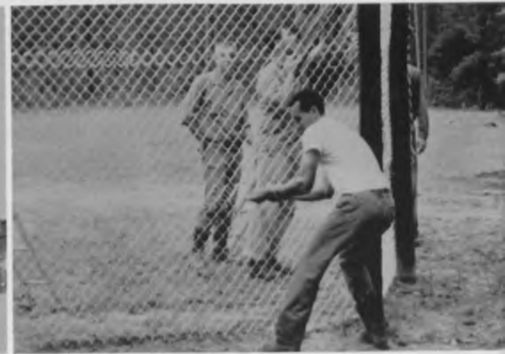
Gee, what a profile!