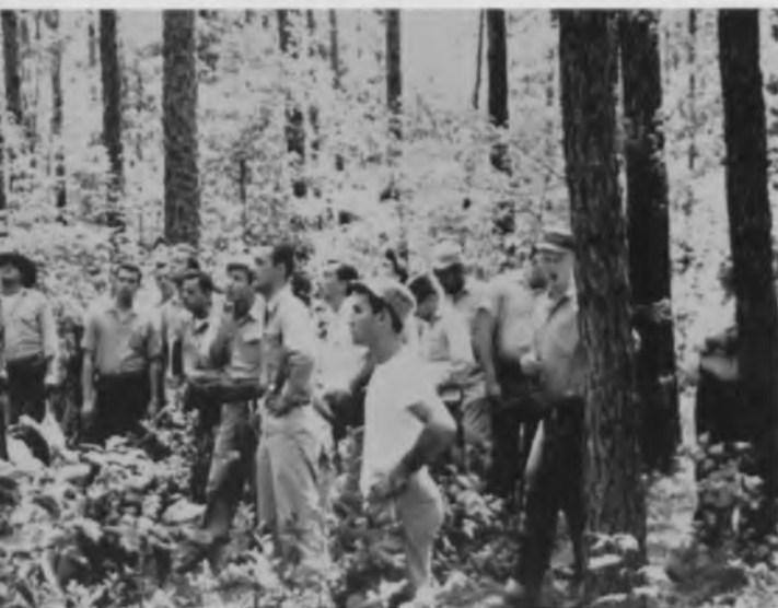
Ho-Hum, a "Beetle" delight