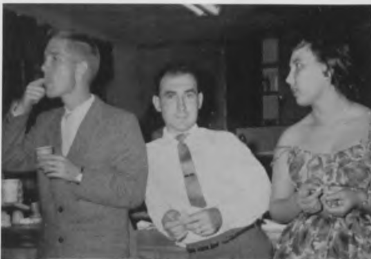
"Uhhh . . . it tastes good"