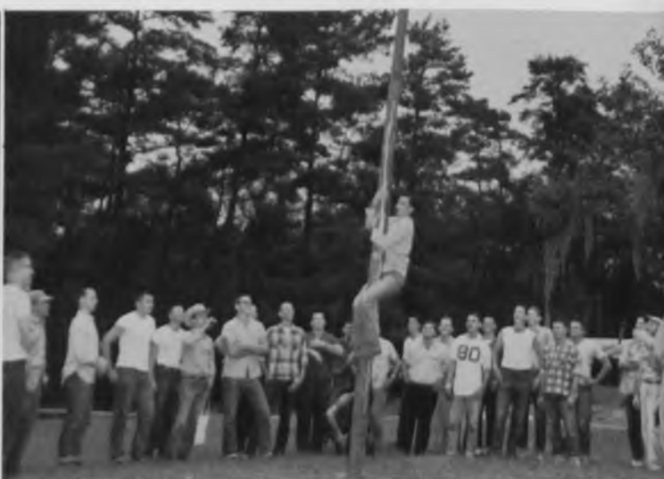
Up or down?