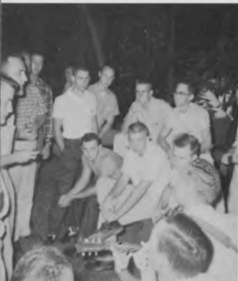
"That good old mountain Dew"