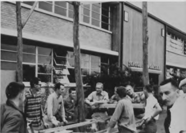
Profile discovered our photographer