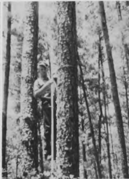
Southern pine bark beetle