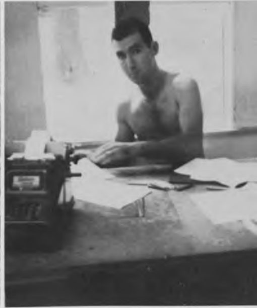
Half-Tarzan, will travel