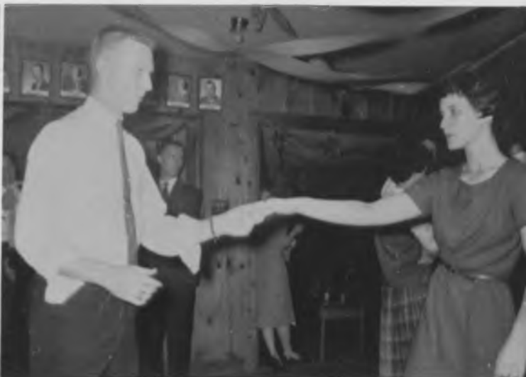
Rock beetle rock