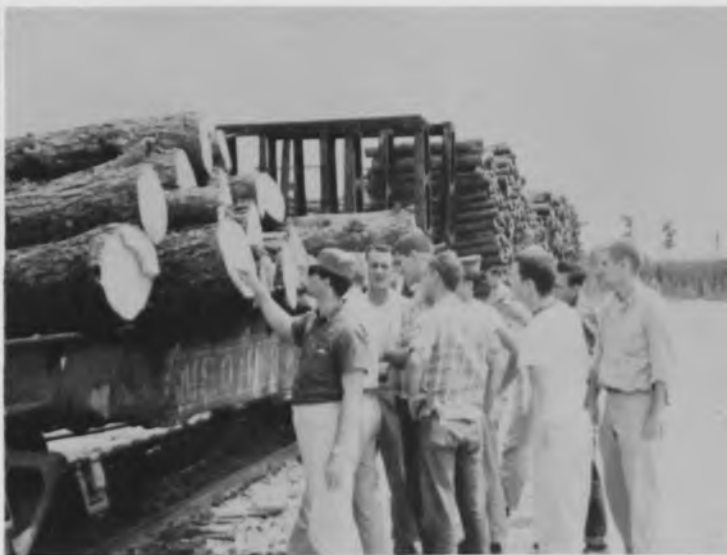
What? Nine years old?