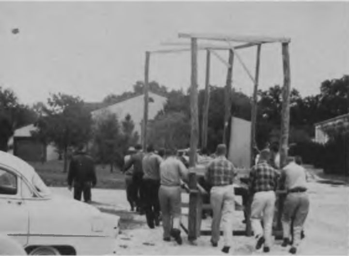
"All together now . . . 1 . . . 2 . . . 3 . . ."