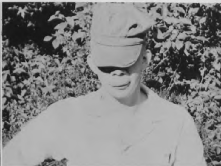
Hot lips. Guess who