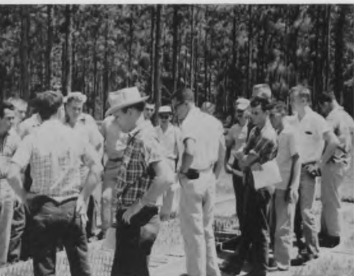
We'll thin for pulp in two years