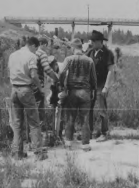
Well, it tastes like water