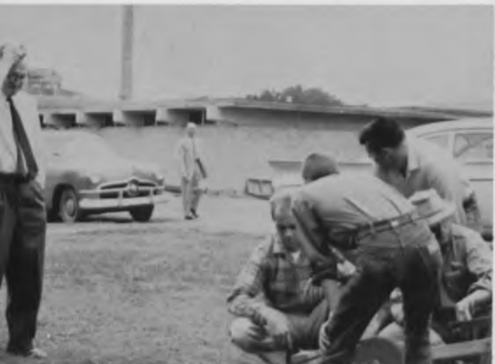
Will it work?