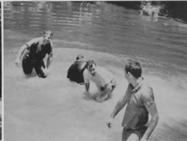
But gang, I took my bath Saturday!