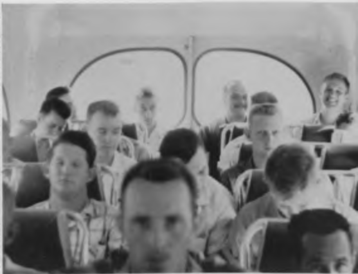
Fearless Foil and his Combat-ready troops