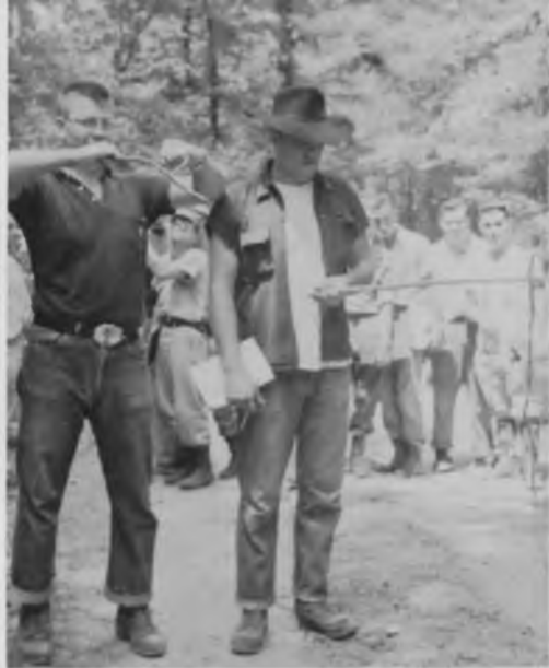
"This is how we do it in Texas"