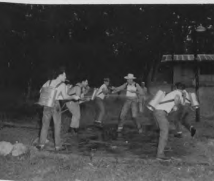
"Watch your cigars, boys"