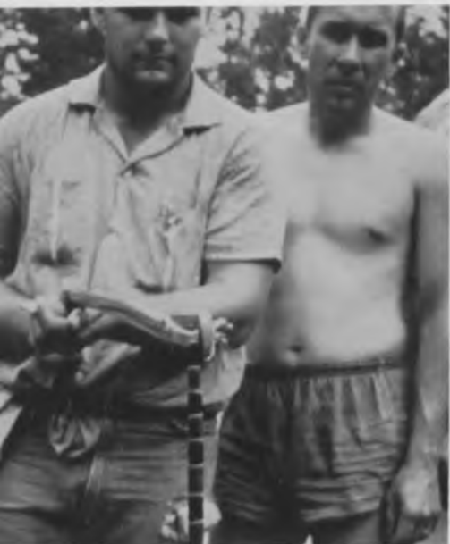
The bad and the beautiful