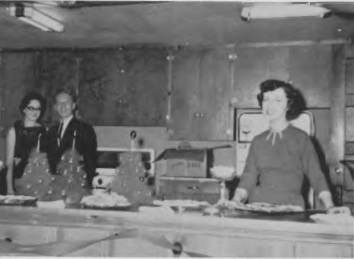
"Christmasy, isn't it"