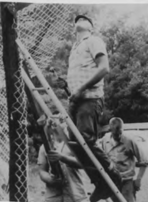
I still wish I could catch a trump