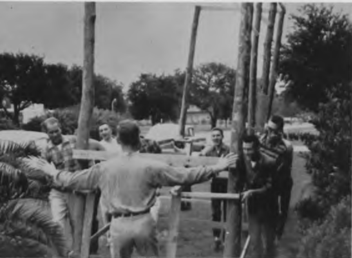
Easy does it . . . right! . . . left! . . .