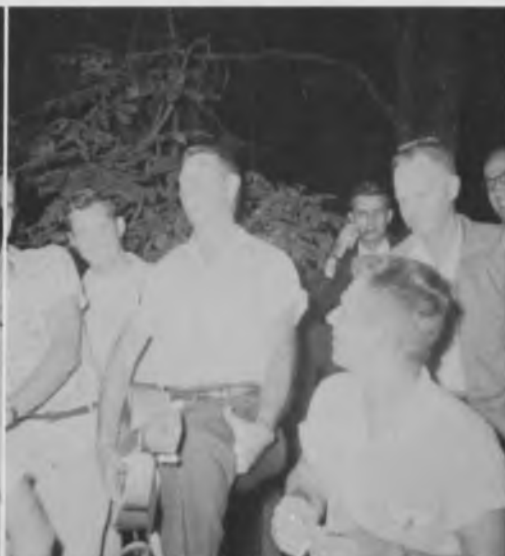
"I'll get you, John!"