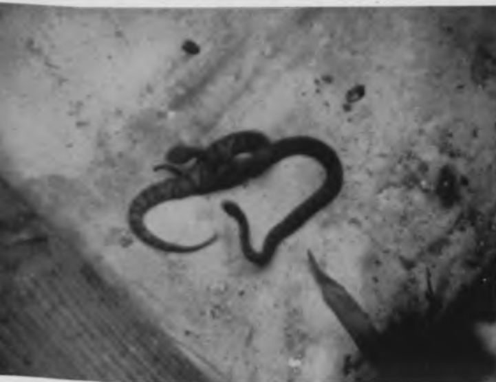
The snake pit

Cruising Data: The CFI system is used, as set up by a departed wise man, using the following aids: 2 decks of cards (jokers present), 1 ouija board, 1 crystal ball and 1 simple instruction book, "Figure it out" (19 . . .)