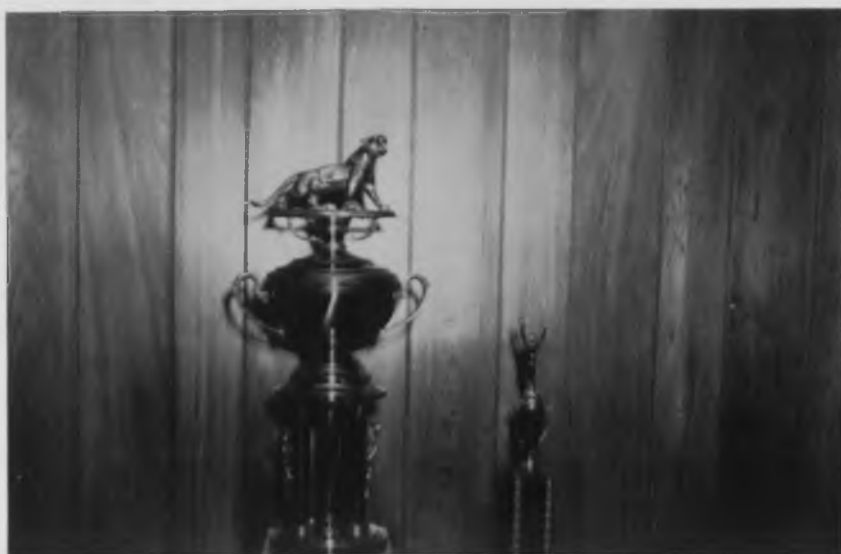
Our Homecoming Won The James A. Noe Sweepstakes Trophy.