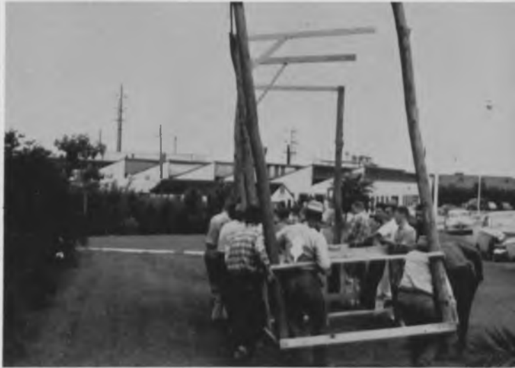
Well, still together