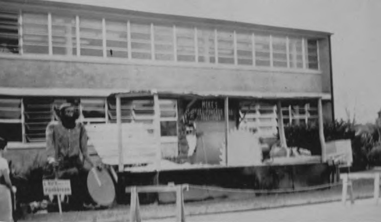
The Display (After The Rain)