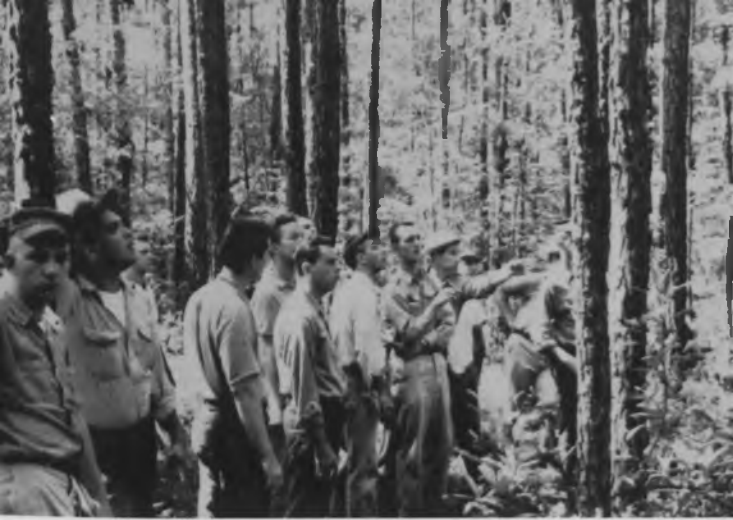
No, I'd cut this one and leave that one